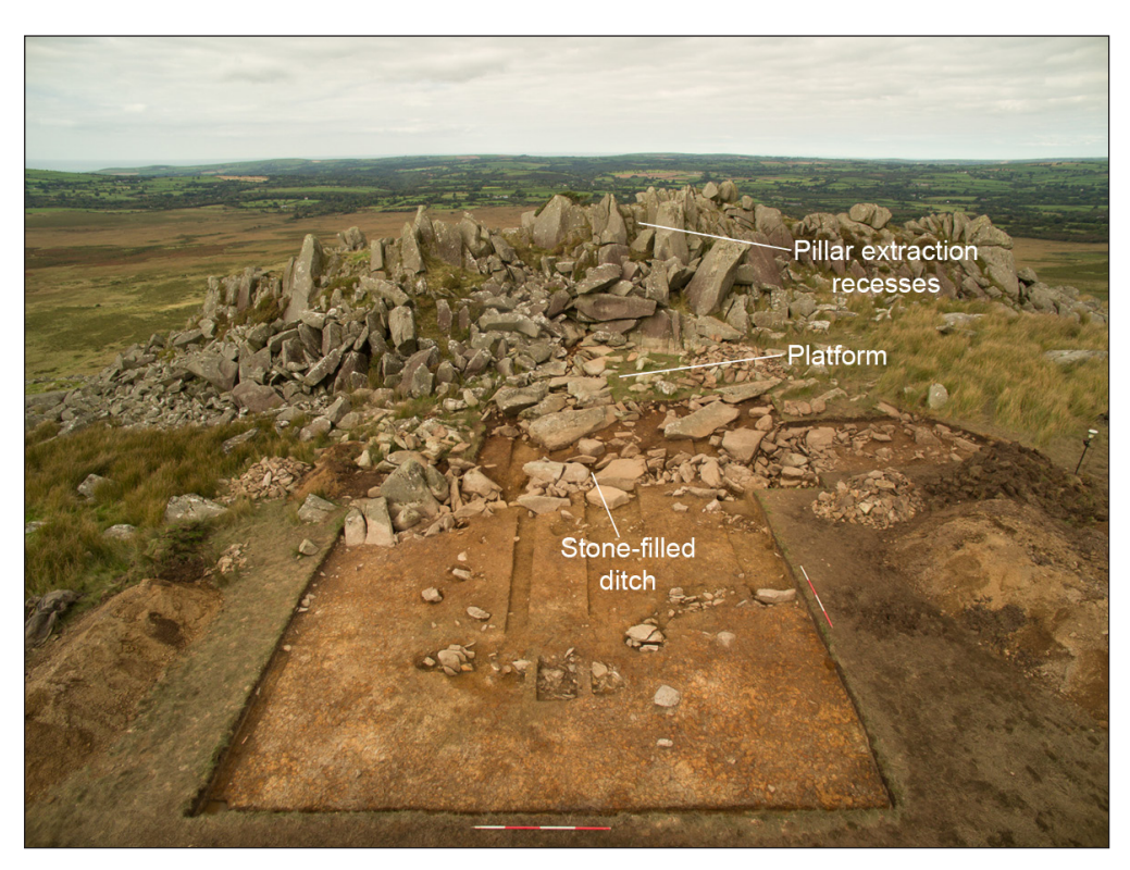
Figure 2: Excavations at Carn Goedog, viewed from the South, showing the outcrop, the Neolithic platform and the stone-filled Neolithic ditch.

So where were the bluestones of Craig Rhosy-felin and Carn Goedog initially taken? Since monoliths were extracted at different times from the two quarries, it seems likely that they were incorporated either into two monuments or into a two-phase monument, likely to be located in their vicinity, before