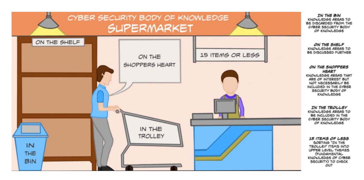
Figure 1: The Supermarket metaphor used for participatory workshops

This sorting exercise was followed by a 15 items or less task during which participants were asked to sort the 'in the trolley' KAs into groups of top-level and sub-level KAs.