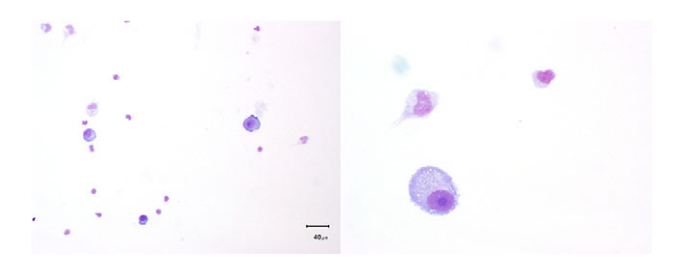
Figure 2: Photographs of CSF cytospins stained with MGG (May Gruenwald Giemsa) stain. The low power image on the left shows scattered tumour cells against a background of mononuclear cells. The high power image on the right shows a tumour cell in more detail. Note the large prominent nucleolus, the generally large size of the cell, the deep blue cytoplasm and well-defined cytoplasmic border

no evidence of cord compression, and MRI brain did not demonstrate evidence of radiological progression (Fig. 1c). Lumbar puncture and examination of the cerebrospinal fluid (CSF), however, revealed atypical epithelioid cells likely to represent malignant cells, consistent with intrathecal dissemination of the known metastatic lung adenocarcinoma (Fig. 2). The patient died 2 weeks later.