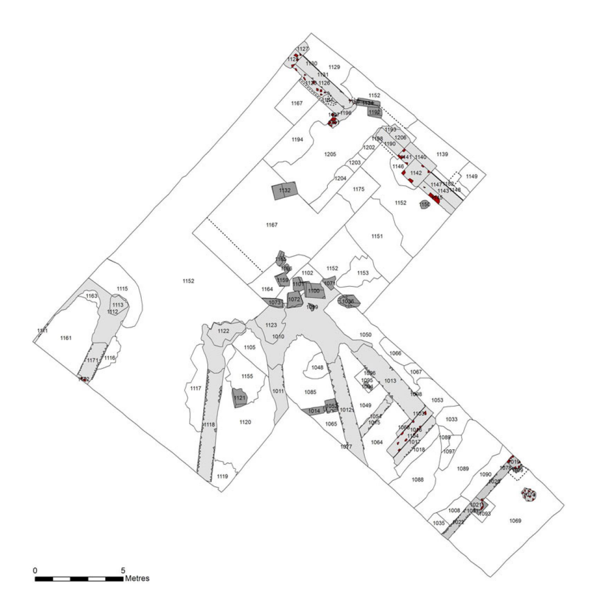
Fig. 1. Plan of the excavation at the end of the 2015 season.