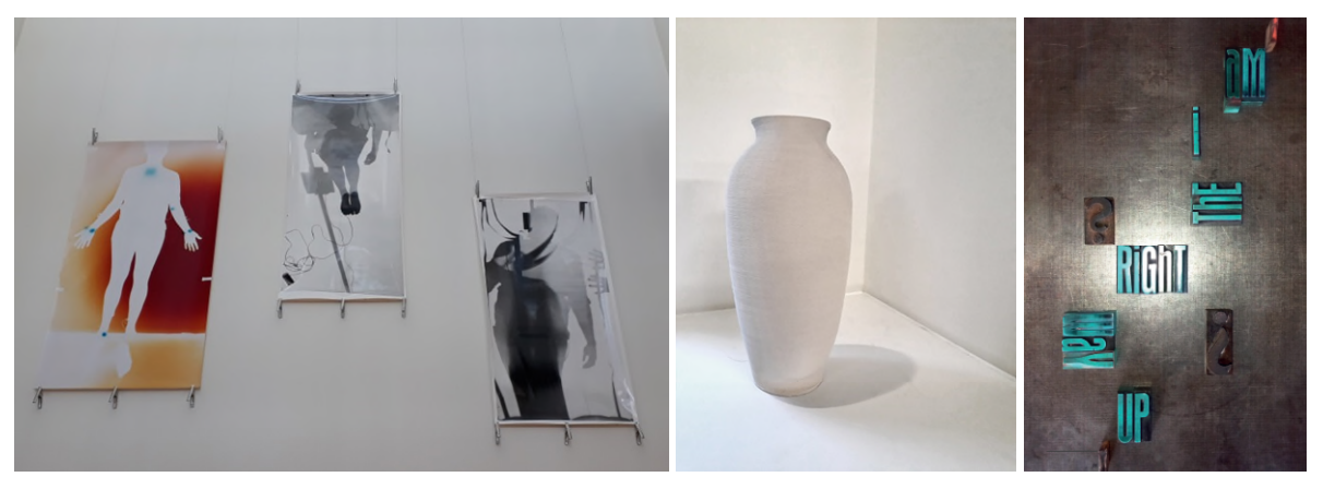
Figure 3. Left panel: Charlie Murphy's 'balance' photograms investigating participants' experiences of self-doubt, disorientation and suspension during balance tests, in the Trajectories exhibition at LifeSpace Science Art Research Gallery, Dundee (2 February – 2 June 2018; <a href="http://lifespace.dundee.ac.uk/exhibition/trajectories">http://lifespace.dundee.ac.uk/exhibition/trajectories</a>). Middle panel: Illusion Vase by Rachel Wilcock (from Central St Martins' BA Ceramic Design collective Studio Senses) using 3d modelling software to visualise changes in perception of shape and orientation from different angles. Right panel: Murphy's typographic experiments with Gaynor's statement provided the stimulus for participatory letter press workshops with people with dementia and care partners during 2017 Dementia Awareness Week.