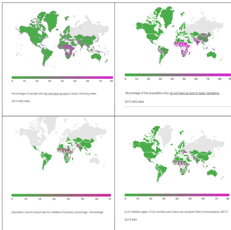
Figure 1: Coverage of minimum core economic, social and cultural rights; water, sanitation, primary school education, essential vaccination. 69