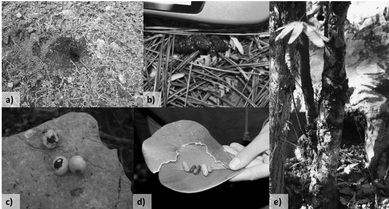
Fig. 2. —Hispaniolan solenodon ( Solenodon paradoxus ) field signs: a) conical-shaped foraging “nose-pokes”; b) feces. Hispaniolan hutia ( Plagiodontia aedium ) field signs: c) gnawed fruit; d) chewed leaf and fecal pellets; e) gnawed bark on tree trunk.

sometimes used to detect presence (e.g., Howe 1974 ); however, the Hispaniolan hutia is semiarboreal, and no urine marks were detected during surveys. Indirect signs of any age were used to confirm presence of species within survey plots, as the aim of the study was to understand presence of native mammals in different landscapes rather than fine-scale temporal habitat or resource use. Evidence of non-native mammal species was not recorded systematically.