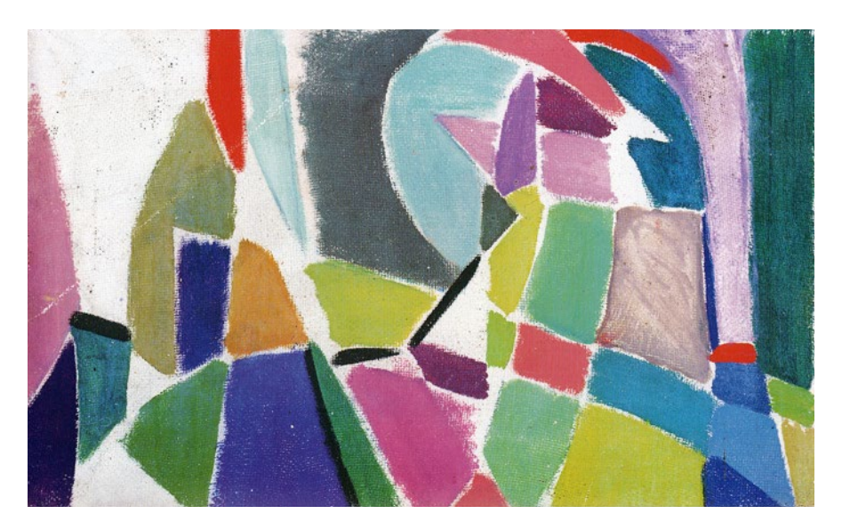
Figure 3 Antonio Sanfilippo, senza titolo , 1947, 12/47. Oil on canvas, 19 x 42 cm. Archivio Accardi Sanfilippo, Rome.

The works by Carla Accardi, Antonio Sanfilippo and Ugo Attardi from 1947 connect most closely to each other in their exploration of the movement of form in the visible world. These small canvases are painted lightly with small shapes of patchwork colours, many with loosely brushed blurry edges that seem to resist the neater lines of a machine aesthetic of geometric abstraction (1947, figures 1-4). Thin borders of unpainted canvas