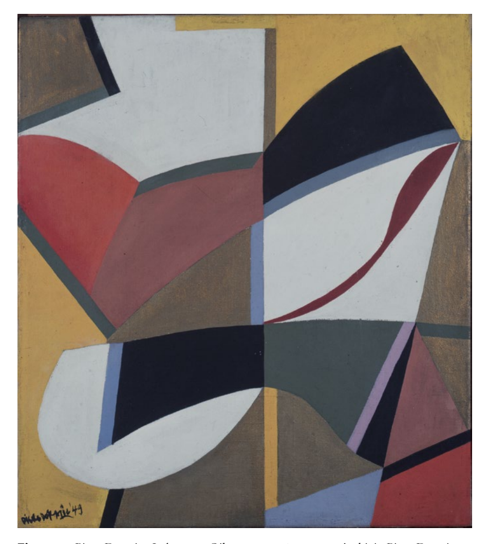
Figure 5 Piero Dorazio, Leda , 1949. Oil on canvas, 62 x 55cm. Archivio Piero Dorazio, Milan. © DACS 2018. Courtesy of Archivio Piero Dorazio.

[a]rt exists that one may recover the sensation of life; it exists to make one feel things, to make the stone stony . The purpose of art is to impart the sensation of things as they are perceived, and not as they are known. The technique of art is to make objects 'unfamiliar,' to make forms difficult, to increase the difficulty and length of perception because the process of perception is an aesthetic end in itself and must be prolonged.<sup>19</sup>