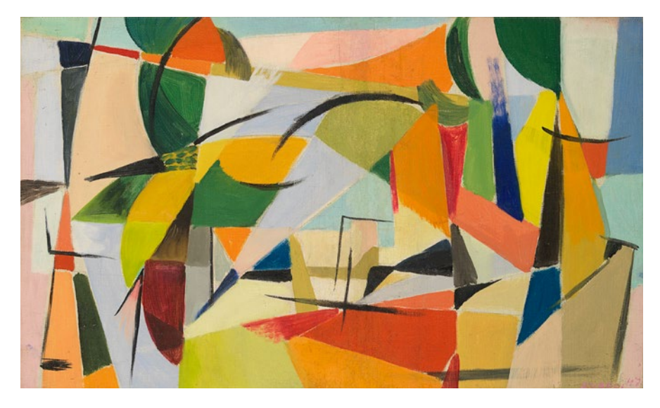
Figure 1 Carla Accardi, Scomposizione , 1947. Oil on canvas, 33 x 55.5 cm. Museo del Novecento, Milan.

rhetoric, although how this should be articulated was proving divisive. The competing demands for artistic autonomy and political commitment formed a tightrope along which many artists were feeling their way, negotiating new artistic freedom while staying loyal to an anti-fascist politics that was often expressed in Marxist terms. Tortured debates were taking place between groups of artists across Italy, which ruminated on the binaries of form and content, and the political implications of each.<sup>3</sup> Several contemporary writers, film-makers and artists, such as Guttuso, held content to be most important, and realism was considered by many to be the only legitimate mode of artistic address in a post-war and post-fascist Italy. This was, in part, because of Marxist demands to bring home the harsh realities of ubiquitous poverty in a legible form, and, in part, also because of the perceived redundancy of Italian modernist art after Futurism's close relationship with fascism during Mussolini's regime, condemned by many as almost symbiotic. Walter Benjamin had written that their entwinement had led to the aestheticisation of politics, and like Benjamin had done, many in Italy were now calling instead for the politicisation of aesthetics.4