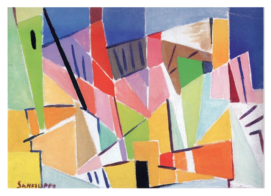
Figure 2 Antonio Sanfilippo, Paesaggio , 1947, 1/47. Oil on canvas, 30 x 40 cm. Archivio Accardi Sanfilippo, Rome.

irreconcilable'. This was a reference to the earlier criticism of the Russian Formalists' systematic theory of literature, which had been made by Marxist theorists on the basis that such a purely formal system ignored the material conditions in which art and literature were produced, and with which they should be in communication. Leon Trotsky's attack on the Formalist School in Literature and Revolution (1924) had concluded: '[t]hey believe that "In the beginning was the Word". But we believe that in the beginning was the deed. The Word followed, as its phonetic shadow'. The Forma manifesto's oblique reference to this earlier divorce acted, then, in the first instance to link Forma's artistic theory with the Russian Formalists and, in turn, was an attempt to rupture with any political fiat on artistic style. For Forma to defy Guttuso's PCI-sponsored realism may have been daring, but to attempt to resurrect the concepts of Russian Formalism in a visual art form as a valid Marxist alternative, ran greater risks including that of being dismissed as disingenuous or just naïve. Through the following exploration of some