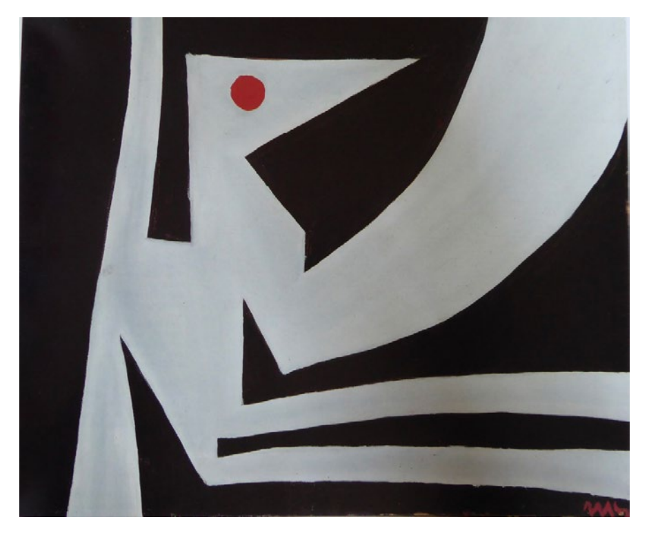
Figure 6 Mino Guerrini, Il Sariga , 1948. Oil, tempera, lentils, salt, car paints on canvas, 50 x 60 cm. Collezione Achille Perilli, Orvieto. © DACS 2018. Courtesy of Collezione Achille Perilli, Orvieto.

Guerrini's work is less ambitious than Boetti's, his earlier use of car paints in what appears to be a latent gesture of resistance, foreshadows Boetti's political play with these same industrial materials.