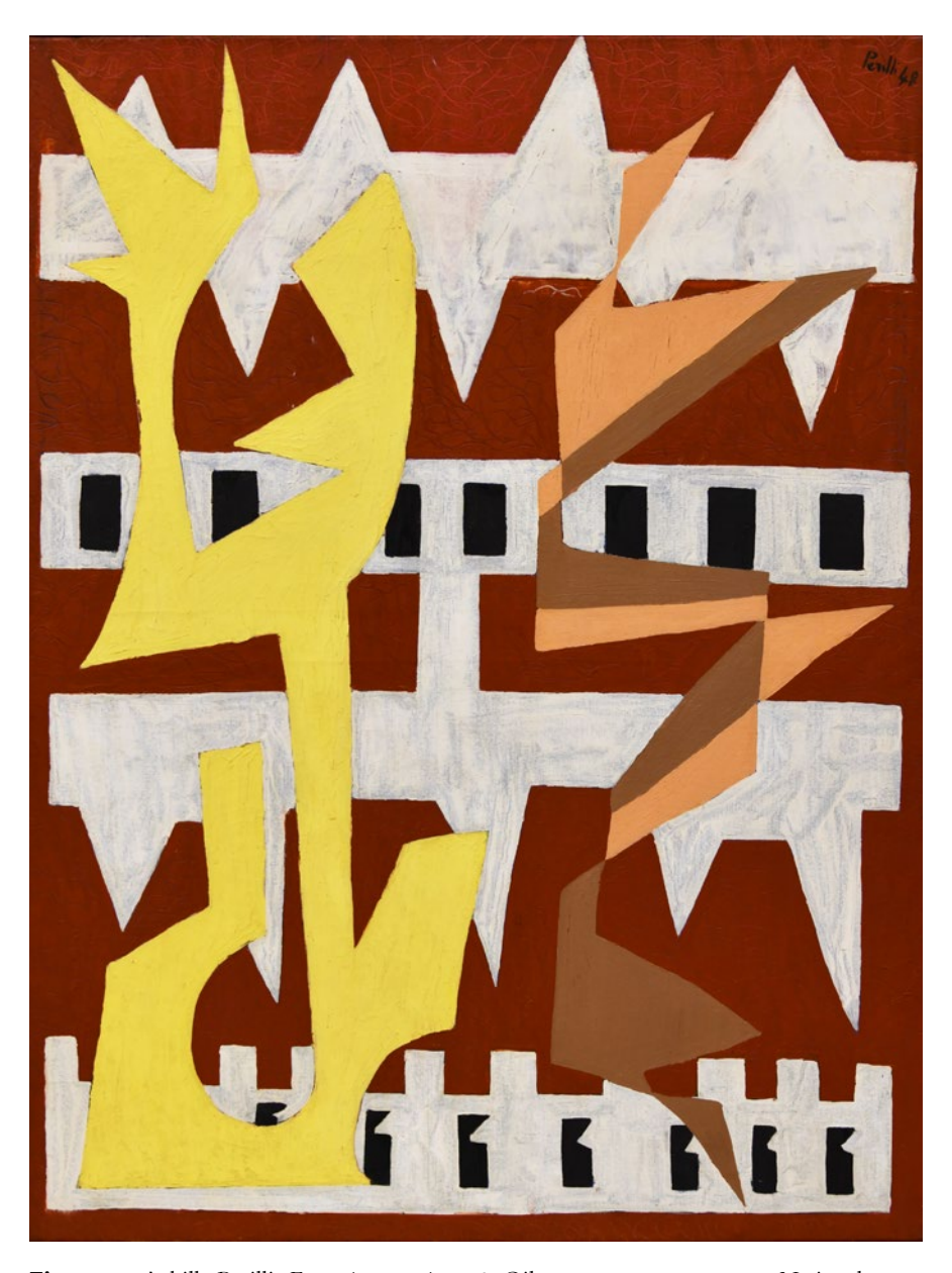
Figure 7 Achille Perilli, Forme in nevrosi , 1948. Oil on canvas, 100 x 70 cm. National Gallery of Modern and Contemporary Art, Rome.