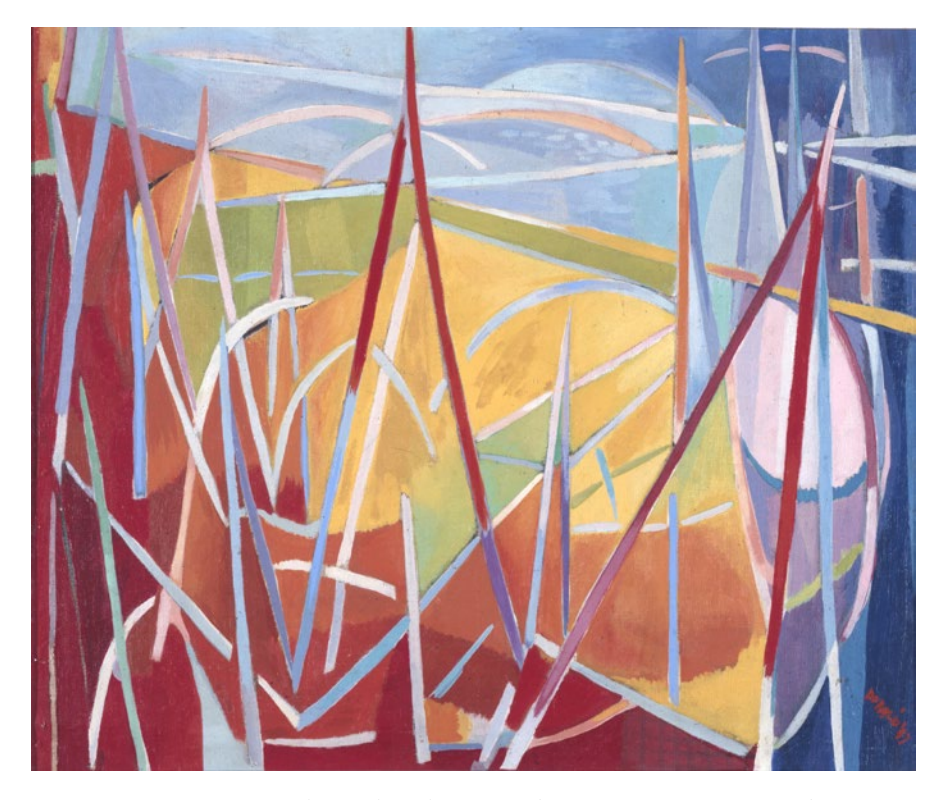
Figure 10 Piero Dorazio Il ponte di Carlo , 1947. Oil on canvas, 55 x 66 cm. Archivio Piero Dorazio, Milan.

photographs of Forma's works are placed beside advertisements for restaurants and shops. With their small portable measurements included below them, these photos can begin to resemble the neighbouring adverts. The spectre of a more cynical age, where an art object became another consumable thing, may have already been emerging as victor in Gramsci's struggle, coming into view in these pages despite all of Forma's declarations to the contrary.