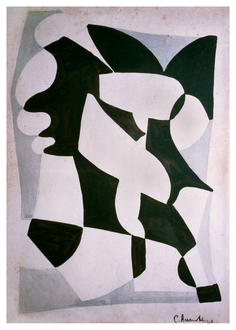
Figure 8 Carla Accardi, Composizione , 1949. Pencil and watercolour on paper, 43 x 30 cm. Archivio Accardi Sanfilippo, Rome.