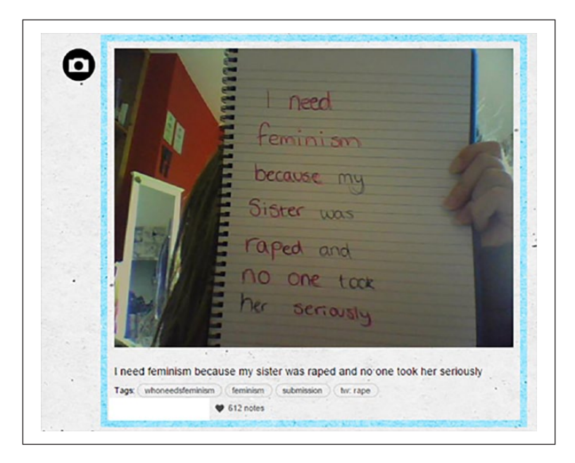
Figure 1. Who needs feminism? submission. Author screenshot.

being taken seriously when confiding in, or reporting the assault to others. This "secondassault" is a well-known phenomenon which has been a central part of feminist theorizing on sexual violence (Wolburt Burgess et al., 2009), whereby the post-assault experience can be just as traumatic as the assault itself. This is because victims are routinely subjected to questioning about their appearance, behavior, lifestyle, or sexual past, as a way of transferring blame to them (Benedict, 1992; Bonnes, 2013; Herman, 2005; Meyer, 2010; Worthington, 2008). For example, as one contributor in Figure 1 stated, "I need feminism because my sister was raped and no one took her seriously."