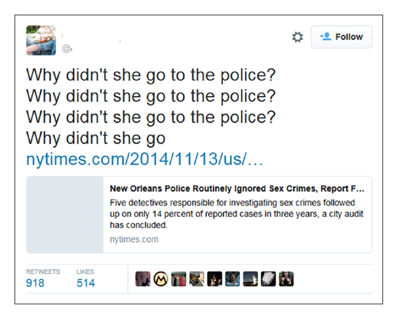
Figure 5. Tweet explaining why people do not report their assault.

and conventions which emerge within and between the digital media platforms Tumblr and Twitter and highlights the ways some of these conventions are simply not possible within non-digitized spaces. These new digitized narratives not only shape what is disclosed and known about sexual violence, but what is felt and experienced, as they generate affective charges, for example, through the visceral creation of hand-crafted signs, or "intimate publics" between those who use hashtags to connect their stories of sexual violence.