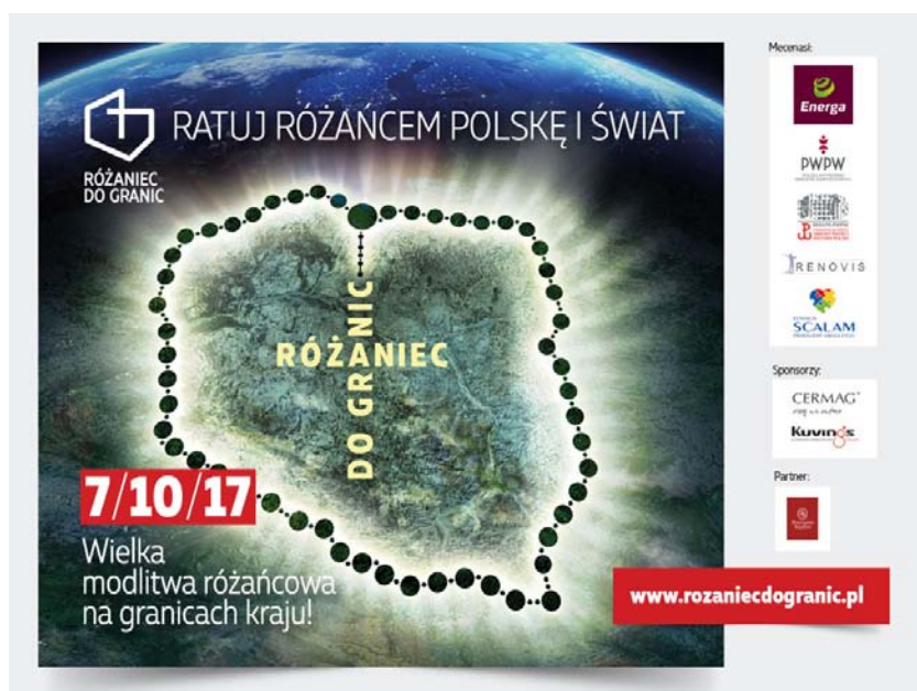
[Fig. 2. Official image publicizing “Rosary to the Borders.” Two inscriptions read: “Save Poland and the world with the Rosary” and “7/10/17 A great Rosary prayer at country borders.” Copyright http://rozaniecdogranic.pl , promotional materials]

particularly foreign, accounts of this event. 24 “The people” were constituted relatively narrowly, within the confines of a specifically interpreted ethno-religious idiom. The new religious-political boundary was designed also to protect one’s own “cultural substance” against the undesired pollution coming from the outside world, suggesting that we deal here not only with the sacralization of politics, but also with the politicization of religion. 25