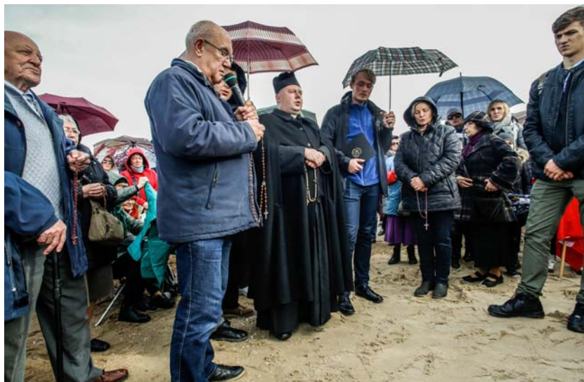
[Fig. 1. “Rosary to the Borders” on the beach in Gdańsk Jelitkowo, 7 October 2017.]

participants that the massive prayer was a message “to other European nations so that they understand that it’s necessary to return to Christian roots so that Europe may remain Europe.” 5 The event was also advertised on TV and endorsed on Twitter by a number of prominent politicians of the governing Law and Justice party, including the Prime Minister. 6