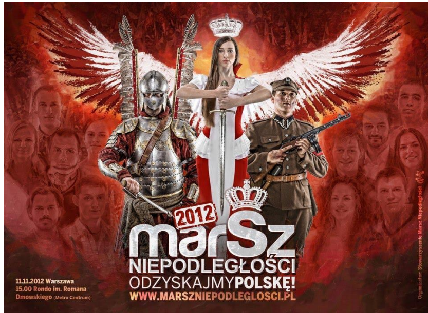
[Fig. 7. Official poster of the 2012 March of Independence. ]

In 2014 the tone changes. From now on, the posters feature larger numbers of marching people waving Polish flags, presumably the crowds participating in the March of Independence. They seem to be designed not only to reflect the growing number of participants, but to encourage others to join in. That year’s poster declares “The Army of Patriots.” The silhouettes of the interwar national leaders appear in the sky above them: Roman Dmowski, Józef Piłsudski, Wincenty Witos and Ignacy Paderewski. In 2015, the poster slogan announces “Poland for Poles – Poles for Poland,” making it clear that the March’s organizers subscribe to a “thick,” exclusionary vision of Polishness without foreigners and are reminding Poles that their chief duty is to serve the Fatherland. The poster features a face of a young woman, her hair adorned with two, white and red, carnations. An eagle’s head appears behind her face. The bottom of the poster shows a crowd waving national flags, covered in red smoke from flares, a typical attribute of the militant football hooligan culture.