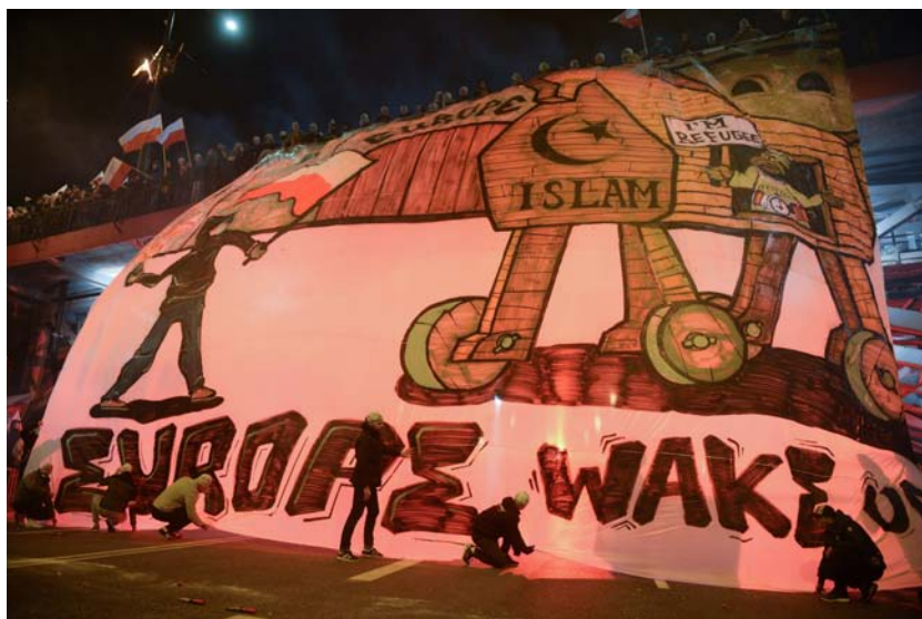
[Fig. 11. Islam as a Trojan Horse, 2017 March of Independence, Warsaw.]

the Crusades (“Deus Vult” 108 ), preferably white (“Europe will be white or uninhabited”), heteronormative and socially conservative (“A boy and a girl – a normal family”; “Abortion kills children”), and adamantly anti-communist (“Use a sickle, use a hammer, smash the red rabble”). They are increasingly committed to defending Europe that faces serious threats, internal and external, these days coming particularly from Islam (“Europe wake up” – an inscription on a massive installation depicting Islam as a Trojan Horse) (Fig. 11). All those motifs were present in the 2017 March, making its symbolism particularly thick.