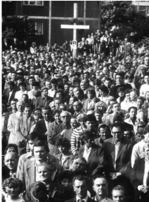
[Fig. 3. Supporters of the striking workers gather at the wooden cross erected outside of Gate Two of the Lenin Shipyard in Gdańsk, August 1980.]

The most powerful rebellion against the communist rule the Soviet Bloc ever experienced, the Solidarity movement, was to a large degree a massive performance of Catholic patriotism imbued with Romantic imagery. The symbolic “tone” of the movement was set during the strikes of August 1980, particularly in Gdańsk. The strike’s décor and worker’s religious rituals were permeated by Catholic motifs (Fig. 3). The grand themes of Polish Romanticism (for example, the belief in the causal power of words or the sense of extraordinary national mission) were often invoked in the performances of professional artists who joined the workers and in the workers’ own poetry. 26