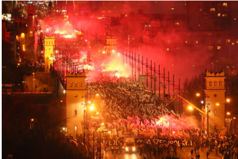
[Fig. 9. The 2017 March of Independence, Poniatowski Bridge, Warsaw, 11 November 2017.]

The official poster, promoting the event's main slogan, "We Want God," seems to depict the Judgment Day. Its main figure is Saint Michael the Archangel, trampling Satan portrayed as a snake. A patron of right-wing groups and a frequent feature in nationalistic tattoos, he symbolizes the "fight against evil, vice, idolatry and heresy," as an ONR website points out. 105 Crowds waving Polish flags march through the sky (Heaven?), dominated by the Jerusalem Cross – a symbol associated with the Crusades and the Knights of the Holy Sepulcher. The damned, engulfed by flames, descend to an abyss (Hell?) that has opened in front of the building of the Council of Ministers in Warsaw. To the inscription featured on the actual building's façade, "Honor and Fatherland," the poster's creator added the word "God," replacing the slogan with a version that emphasizes the indispensability of Catholicism in Polish national culture and state affairs (Fig. 10).