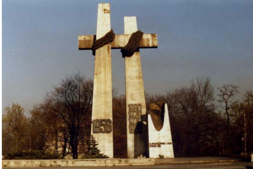
[Fig. 4. The Poznań monument as unveiled on 28 June 1981.]

come to symbolize 66 the 1956 rebellion, “For Freedom, Law and Bread” is engraved on the eagle’s torso (Fig. 4). 67