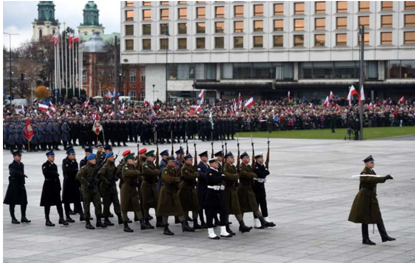
[Fig. 6. The state-centered celebrations of 11 November in 2015, the Piłsudski Square, Warsaw.]

Along the way, however, the manner of celebrating changed as far-right rallies and marches were gaining popularity, attracting publicity, and growing in numbers. This process accelerated after the unveiling a statue of Dmowski on Warsaw's Rozdroże Square on 10 November 2006. 94 The symbolic space of Warsaw acquired a powerful marker whose presence created a new opportunity to invigorate the Dmowskiite tradition, narrowly nationalistic in tone by contrast to Piłsudskiite open patriotism. As other observers also noted, 2006 constitutes a critical juncture after which the game of symbolic politics in Poland changed, with the far-right narratives and performances acquiring new visibility. 95 At their core were ceremonial invocations of extreme nationalism increasingly intertwined with the nationalized version of Polish Catholicism. By 2017, both narratives were tightly coupled, as the massive nationalist March of Independence in Warsaw was organized under the slogan "We Want God."