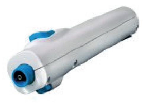
(Extracted from Google Images: Drugs.com, August 6, 2017) Figure 2. Apomorphine: penject.