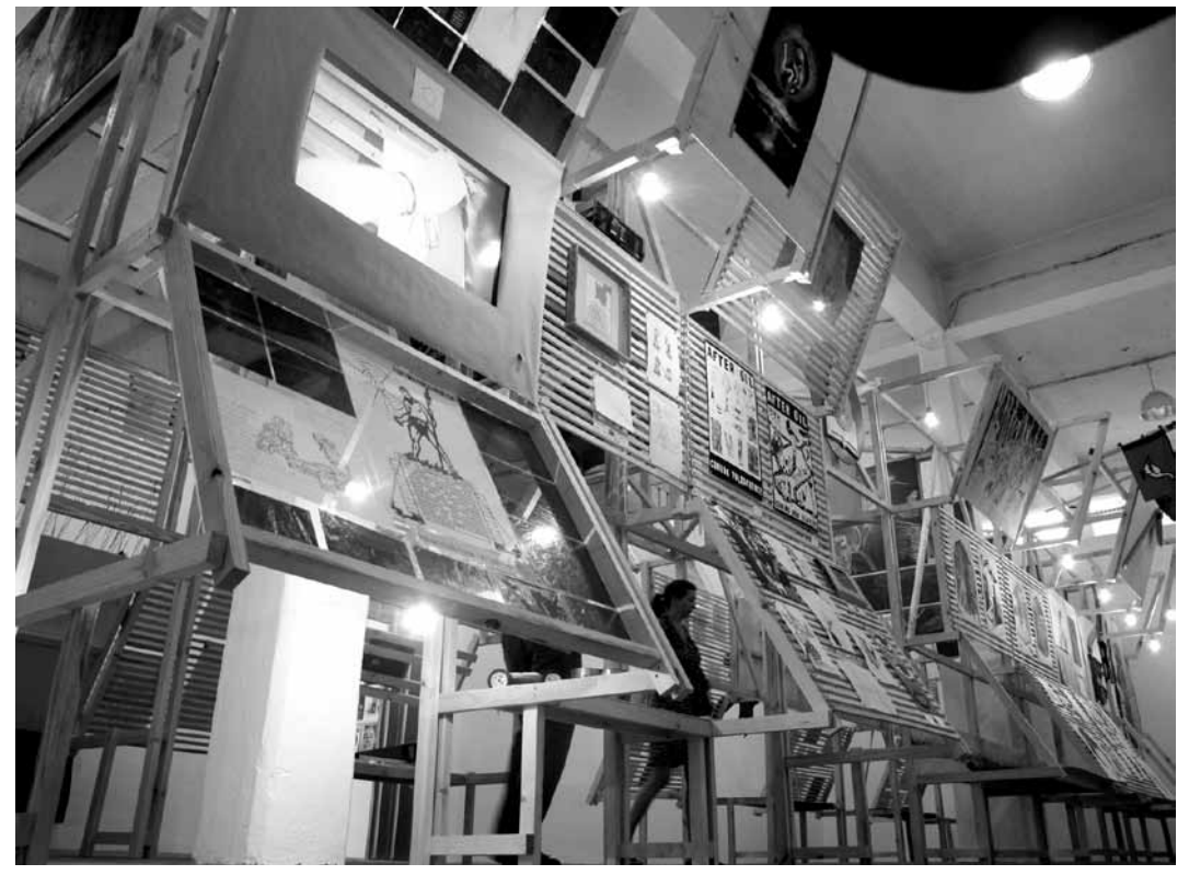
Fig. 1. Ex-artist's collective (Anikó Loránt–Kaszás Tamás): PANGAEA, visual aid for historical consciousness, 2011, mixed media installation, variable size. Realised in the architectural and conceptual frame of the 12th Istanbul Biennial

An affinity for collective approaches also chimes with the networked culture and modus operandi of contemporary protest movements, whose emergence in the wake of globalization was influentially described by anti-capitalist theorists Michael Hardt and Antonio Negri in their paperback popularization of the notion of the Multitude – a revolutionary social subject that 'is composed of innumerable internal differences that can never be reduced to a unity or a single identity.'<sup>13</sup> Drawing on the liberating social and economic insights of the Italian Operarism of the 1970s, a 'cultural, post-Marxist leftwing political movement' that was 'opposed to work ethics and hierarchy as much as exclusive ideological rigidity',<sup>14</sup> Hardt and Negri developed radical cri-