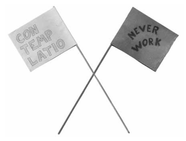
Fig. 4. Tamás Kaszás: Contemplatio X Never work, 2007, water color and pencil on paper installed on a wood stick, ~35×45cm

The interconnectedness of art and life forms the core of the Pangaea section labelled As We Live It , interestingly turning their working motto into a proclamation 'Never Work' and 'Contemplate', which can be found inscribed on posters and waved on flags ( Fig. 4 ). These ideas also appeared on the starting pages of their self-published Self-Orientation Book on the occasion of the joint exhibition in Liget Gallery in 2007. A watercolour depicts a solitary figure sitting