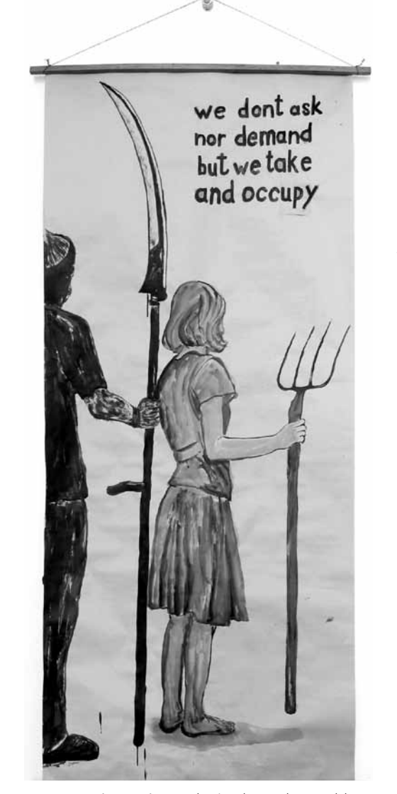
Fig. 2. Tamás Kaszás: We don't ask nor demand, but we take and occupy, 2011, ink and home made walnut dye on paper, 228×100cm

come 'common property'.<sup>23</sup> The idealization of the medieval commons that peasant revolt sought to protect has tended to be undertaken in a mood of nostalgia and regret for its pass-