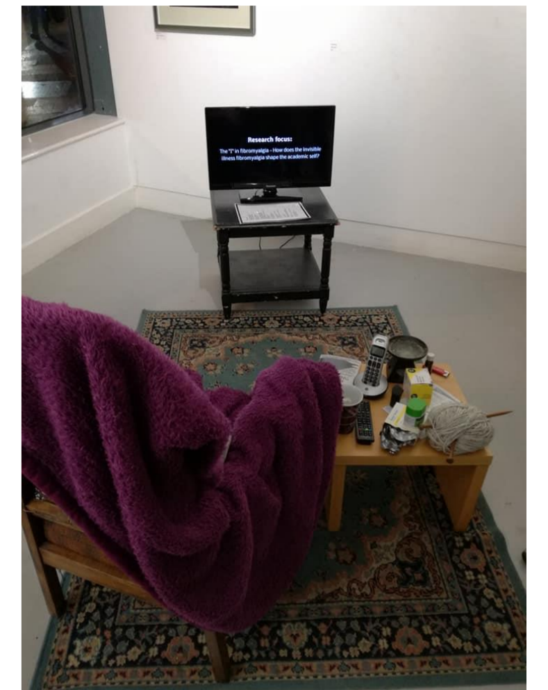
The Horsebridge Arts Centre, Whitstable, January 2018.

Through artistic means the installation informs, teaches, raises awareness, develops empathy and understanding and thus aims to have a long-lasting effect on gallery visitors.