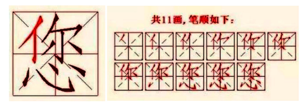
Figure 1. Template for Chinese character formation and stroke order (x 11) for the word 您 nin, 'you' polite form.

broadly on Mandarin, though many Mandarin speakers have accents that are quite different from Putonghua.<sup>2</sup>