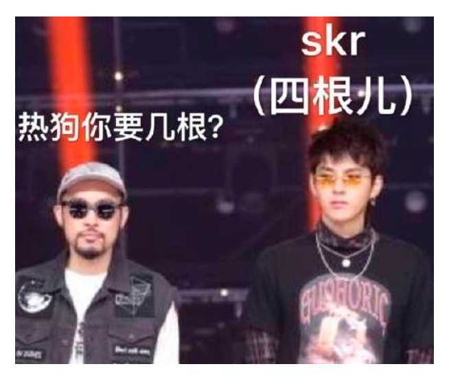
Figure 8. Meme created about Kris Wu: The man on the left asks, 'How many hotdogs do you want?', and the caption above Kris Wu on the right is his reply, 'skr (四根儿)' (si qer 'four long and thing objects').

meme (Figure 9) made fun of the scenario with a picture of Wu coming out of an airport. The caption says, 让我看看 s 哪 skr 在制造谣言 (rang wo kankan s na skr zai zhizao yaoyan 'Let me see who's making rumours'), in which是哪个儿(shi nager fis who') has been tranßcripted as s哪skr (s na skr). As one comment underneath the meme on the website says, 'This is so funny. I bet it's true'. But telling the truth is not the point; subverting the truth on multiple levels and in multiple directions is. That is what playful subversion is all about, and it is the essence of transcripting.