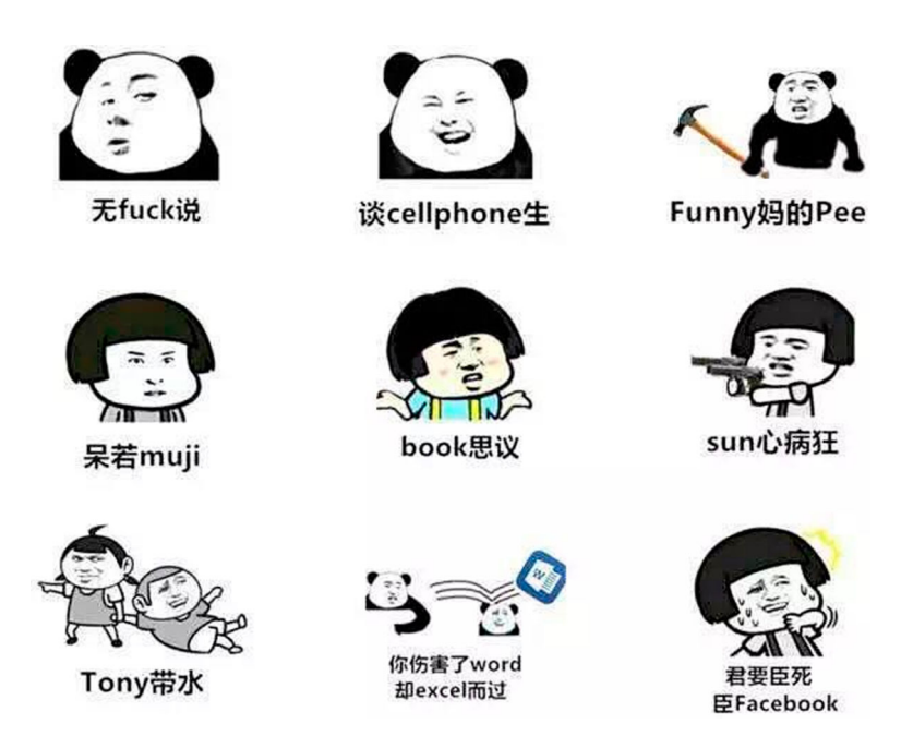
Figure 2. Popular poster with Chinese + English transcript.

美你peace (quan ni peace) = 美你屁事 (quan ni pi shi 'it's none of your business')