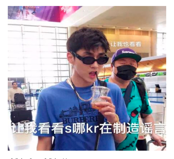
Figure 9. Fake news? Fake Quote? Fake Meme.

meme (Figure 9) made fun of the scenario with a picture of Wu coming out of an airport. The caption says, 让我看看 s 哪 skr 在制造谣言 (rang wo kankan s na skr zai zhizao yaoyan 'Let me see who's making rumours'), in which是哪个儿(shi nager fis who') has been tranßcripted as s哪skr (s na skr). As one comment underneath the meme on the website says, 'This is so funny. I bet it's true'. But telling the truth is not the point; subverting the truth on multiple levels and in multiple directions is. That is what playful subversion is all about, and it is the essence of transcripting.