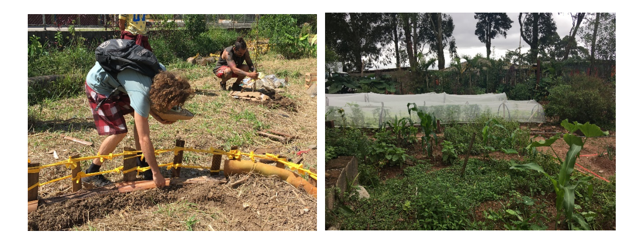
Figure 3. Permaculture methods applied in the settlements of Serra Pelada (Baixa Grande) (left) and Vila Nova Esperança (right).

In the West Zone of São Paulo, the community of the Vila Nova Esperança has developed initiatives to protect and develop green areas in their region. These initiatives emerged at the same time the community became threatened of eviction due to its location in an ecologically protected zone and its proximity to a manancial zone. The threat has been emphasised by authorities through a political discourse around the argument that the community pollutes the area. In response to this, the inhabitants launched a solid waste management initiative along with a peri-urban agricultural zone within the settlement in 2013. Inhabitants of the favela have access to medicinal plants from the community garden where they cultivate vegetables, fruits and herbs. The range of initiatives has expanded over the years and gained attention from NGOs and the public. No further eviction threats have been received by the community. Further water management initiatives are developing, including through a collaboration with the University of São Paulo to construct a plant-based treatment system for the sewage of 40 local households.