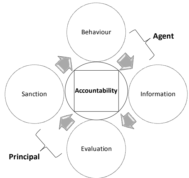
Figure 1 Mechanisms of the accountability process