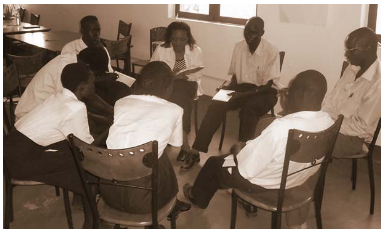
Consulting with Juba Technical High School students. Their views were an important factor in Plan's decision to focus on TVET.