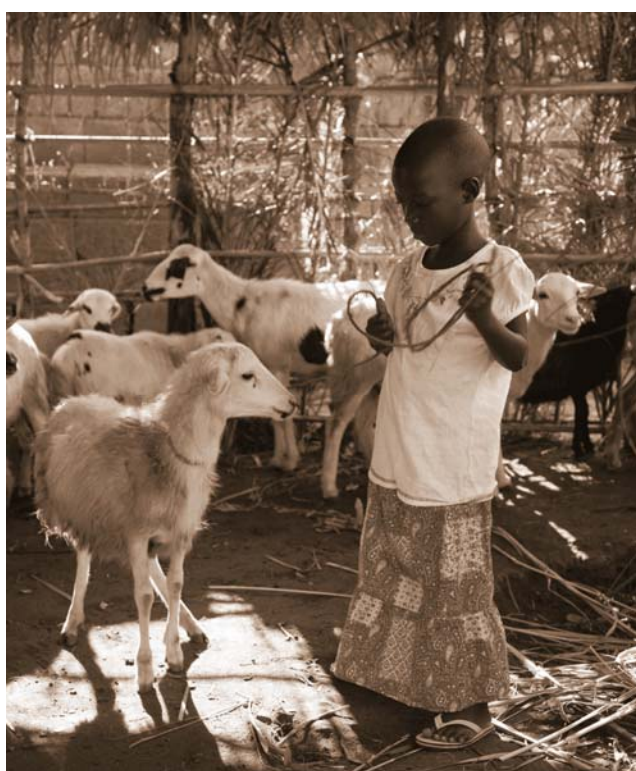
Child looking after goats. c. Steve Theobald, October 2007.

For the very few young men and women who were able to attend 'bush schools' during the wars to complete primary education, few opportunities exist for continuing formal education. The many years of war have almost totally eradicated secondary education in Southern Sudan, together with vocational and technical education (Inter-Agency Network for Education in Emergencies, 2009).