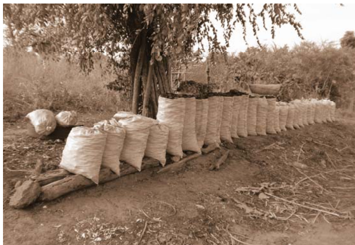
Charcoal business on the road to Lainya. The BEST model will train young people to sustainably realize local enterprise opportunities. c. Ndūng'ū Kahīhu, December 2009.

A SLEN approach (Wheeler et al., 2006) to TVET takes an inclusive and partnerships approach to address the needs of marginalized and vulnerable communities beyond the traditional short-term timeframe of most reintegration and development programs. Agriculture-related skills and training might take community food security and production as a goal. Considerations would be given for traditional approaches to agriculture and livestock including small and communal plots, the importance of cattle to social status and culture, transportation, market access, storage, availability of repairable