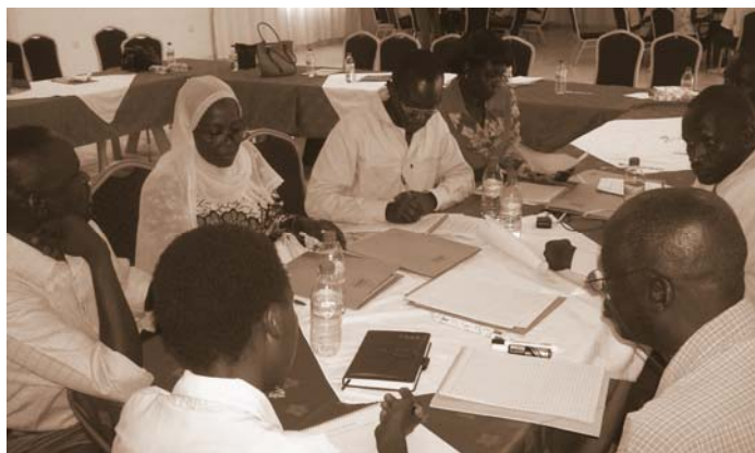
One-day workshop: Group discussion, Juba. March 2009.