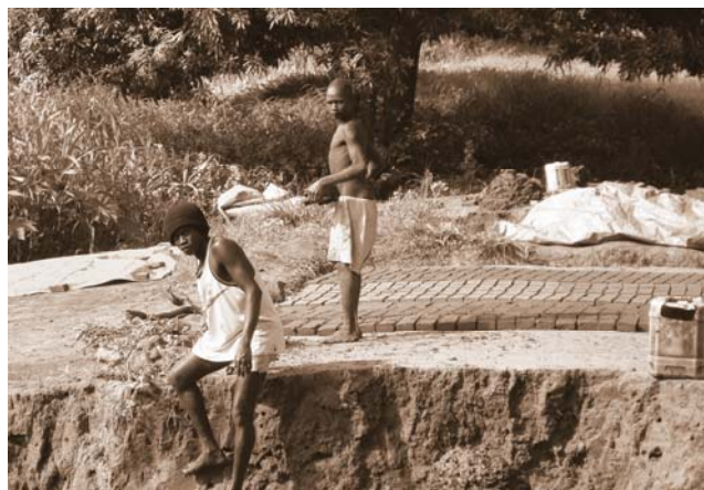
Brick workers, Juba.

The second type of TVET training program should be focused on people with no formal education, including ex-combatants, refugees, widows and other adults who have the responsibility for feeding their families. The government needs to train these community members in vocational skills relevant to local development needs. Short-term, non-formal, TVET training programs for millions of unskilled and unemployed people, especially in the villages, should be developed. Skills associated with traditional livelihoods practiced by rural and traditional communities can be associated with this