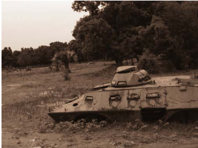
Remnants of the long-running civil war, Juba.

For two decades, the SPLA/M led this second war against the northern-based government. In January 2005, a peace accord called the Comprehensive Peace Agreement (CPA) was signed between the government of Khartoum and the SPLM/A. In the CPA, a “one country, two system” model was adopted, whereby the North and South will share power. In 2011, Southern Sudan will determine whether it wants to secede via a referendum.