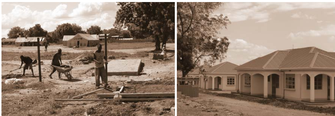
Juba Technical, then and now. Plan hopes that this will be the standard for reconstruction of TVET facilities in South Sudan. Left, building the perimeter fence. Right, the new teachers houses.

The operations of JTS were disturbed by the intensification of war during the SPLA/M period. During this time, Torit and Lainya were transferred to Juba and JTS worked in combination with these technical schools. In 1987, GOS renamed the school Juba Technical Senior Secondary School and, in 1992, it was renamed Juba Technical High Secondary School. Post-CPA, the school once again became JTS. It is now functioning after being renovated and retooled by Plan International.