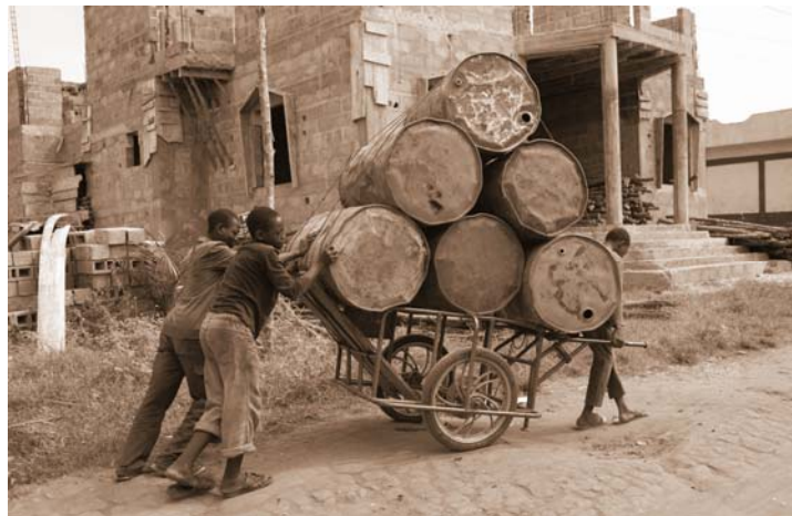
Young entrepreneurs in Benin. Plan's experience with youth livelihood projects elsewhere in Africa is part of the organization's value-add to Southern Sudan. c. Steven Theobald, October 2007.

Harnessing entrepreneurial capacity may create opportunities for some demobilized combatants in Southern Sudan. For example, in May 2006, a high concentration of combatants were awaiting the beginning of demobilization activities in the town of Rumbek and its surrounding area. Of these, many combatant youth were utilizing their skills and resources – including vehicles and contacts – to engage in a number of enterprising activities. These youth expressed a strong desire for entrepreneurial options post-demobilization (Abdelnour et al., 2008b).