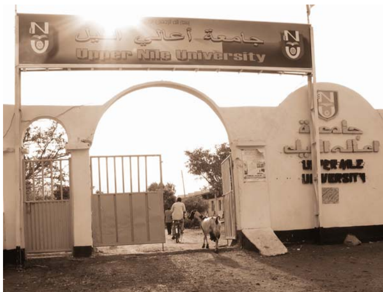
Entrance of Upper Nile University, Malakal.

Importantly, the translation of post-conflict development knowledge and practice from across Sudan can prove beneficial for the development of Southern Sudan. While it is understandable that direct collaboration with organizations based in the north may be viewed as politically undesirable, organizations which have successfully demonstrated social and economic empowerment of local communities can be looked to by policy makers and implementing agencies for their expertise. The development and educational sectors, which have traditionally crossed between Khartoum and Southern Sudan at various times of war and peace, may provide a readily available platform for the sharing of knowledge and experience. University examples include the return of expertise, staff and resources to the Upper Nile University, Juba University and other southern universities from Khartoum. The work of Ahfad University for Women in successfully training large numbers of teachers for early childhood and primary education across ethnic, cultural, religious and political divides can assist Southern universities in addressing the critical need for quality primary school teachers, especially in rural villages. From the development sector, Practical Action's practice of creating and supporting women and community development associations, as well as the dissemination of culturally and market-appropriate technology interventions, can provide extremely useful for communities in Southern Sudan.