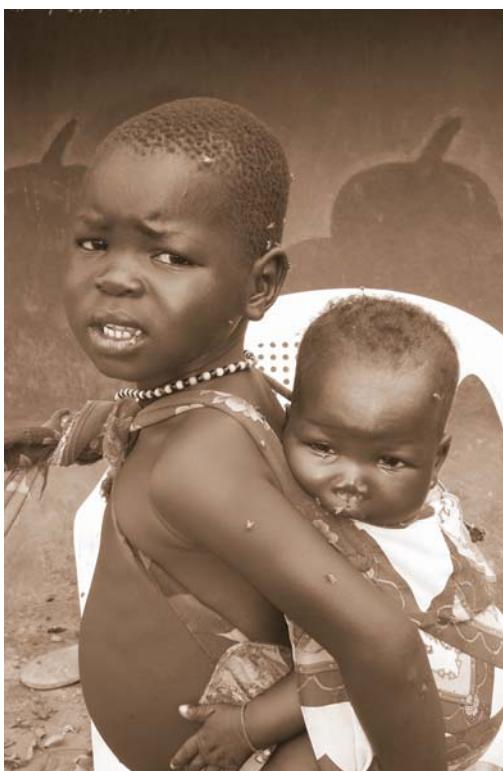
Children looking after children, Torit. c. Dr. Dominic Odwa Atari, March 2009.

Due to the many years of war, the lack of facilities and capacity and the continued tribal structures of many communities in Southern Sudan, many young men and women have missed the opportunity for education. Children in many regions in Southern Sudan are still more economically valuable when they are at home rather than at school. When at home, girls fetch water, cook, clean and take care of little children and babies and boys often look after cattle (Brophy, 2003). Many of these young girls and boys have learnt how to shoot firearms but not how to read and write. When they grow-up, they will have no essential skills and capacities to live in modern society where literacy is a key component of survival.