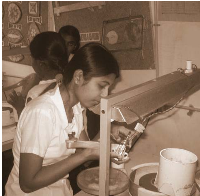
Young woman practices gem cutting in post-tsunami Sri Lanka. This is one of the successful adaptations of the BEST model that Plan hopes to replicate in South Sudan

BEST takes its role as a path-breaker seriously and ensures that its students get a taste of what the middle and upper class students regularly receive in their colleges through industry visits, guest lectures, campus placements and mentoring by corporate managers. This helps the students see what is on the other side. Mentorship is a key element of the model and is important at all levels. While mentorship programs are an obvious component of the facilitators' roles, mentoring by the alumni is also encouraged. Individuals working in government and corporate managers and executives in the private sector act as important mentors to newcomers and graduates in this program.