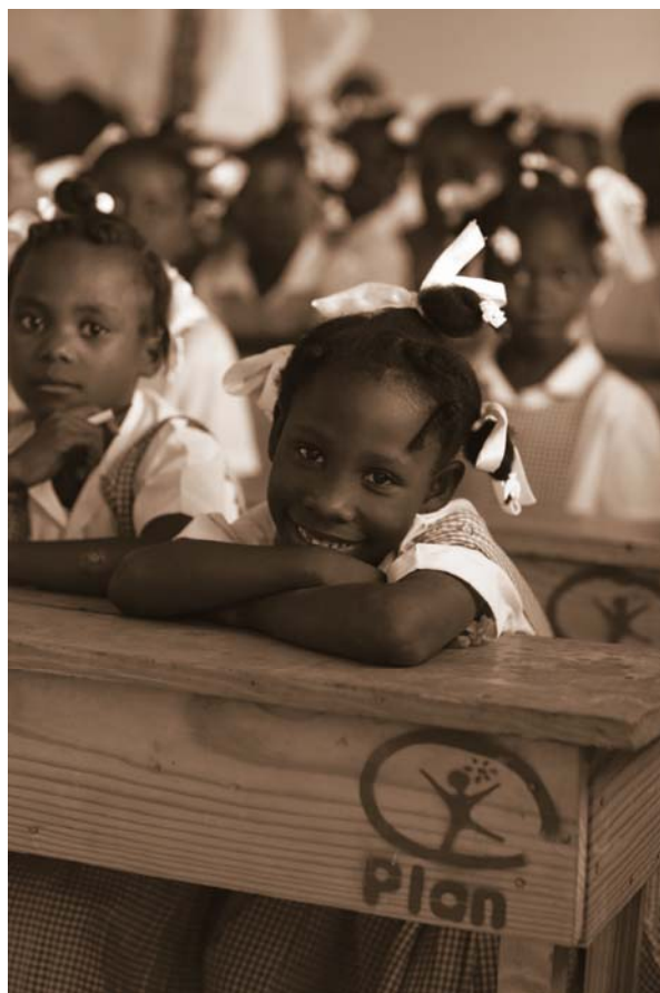
Girls learning in Haiti; Plan's experience working in post conflict countries is one of the key contributions to work in South Sudan c. Steven Theobald , March 2007.

During the past 23 years, Plan has implemented programs in Northern Sudan including Eastern Sudan and Darfur. In 2005, Plan set out to expand its activities in Darfur and Southern Sudan by initiating semi-independent programs. The Plan Southern Sudan program was officially registered in 2005. The first year of this Program was devoted to feasibility data collection and planning.