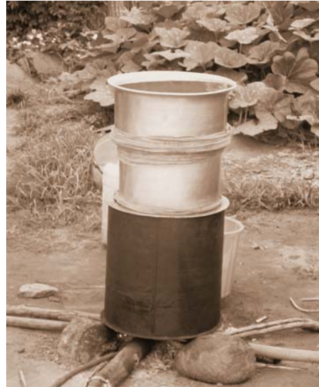
Brewing of local alcohol, Juba.