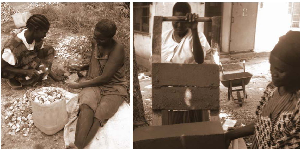
Women crushing rocks near Juba (left), and using appropriate technology for brick-making (right).