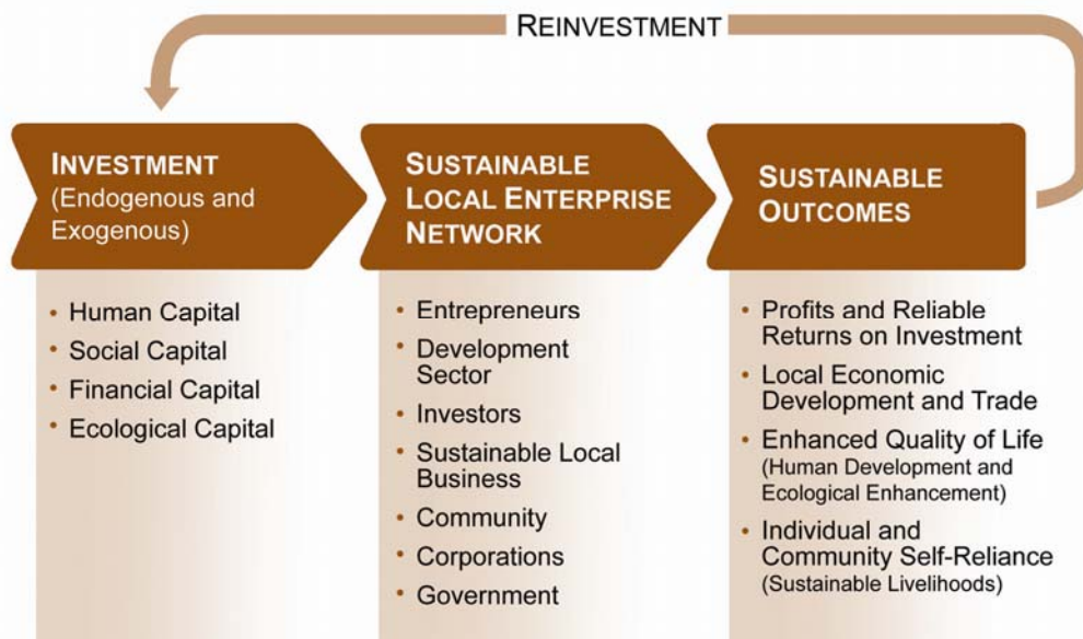
Figure 2: SLEN Development Model