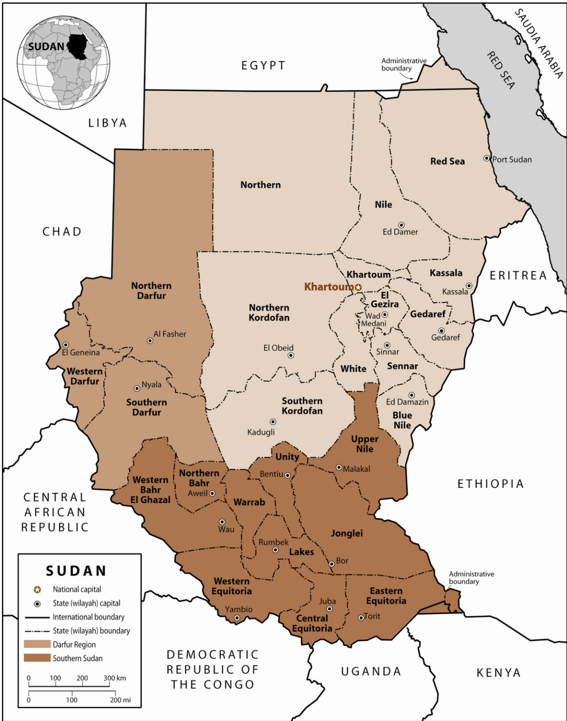
Figure 1: Map of Sudan

Adapted from UN Sudan Information Gateway, Map No. 3707 Rev. 10 April 2007.