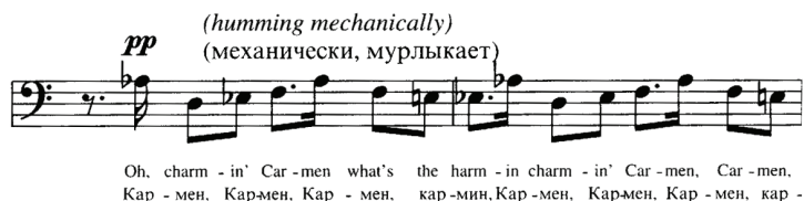
Fig. 16. ‘Carmen’ theme (Humbert).