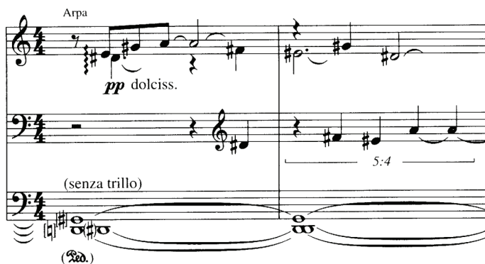
Fig. 13. 'Humbert's sin'.