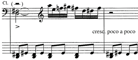
Fig. 2. 'Car horn'.