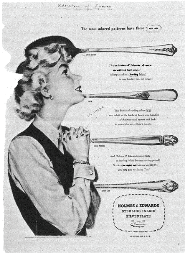
Fig. 1. 'Adoration of Spoons'.

Philistinism', Nabokov explores the links between poshlust and, among other things, the 'rich philistinism emanating from advertisements'. 58 The essay includes a commentary on a 1950s American advertisement for silverware (fig. 1), prepared by Nabokov to illustrate the concept of poshlust and titled 'Adoration of Spoons'. Recalling the Adoration of the Magi, Nabokov compares this sham, philistine adoration — the veneration of material goods — to quasi-religious worship, presenting this image of material desire raised to the level of a beatific vision.