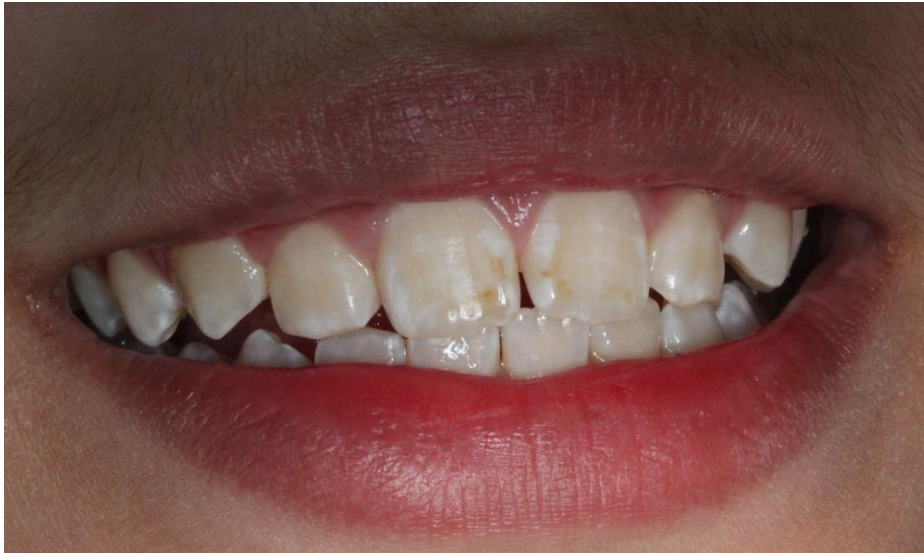
Fig. 1 Enamel hypomineralisation