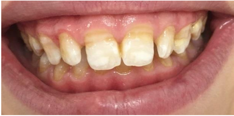
Fig. 3 Chronological hypoplasia