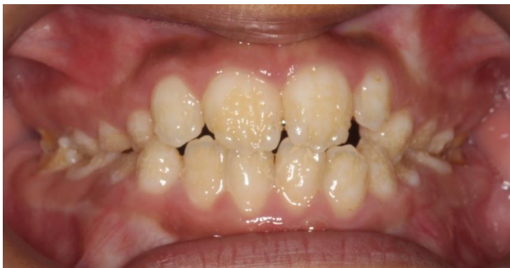
Fig. 2 Enamel Hypoplasia