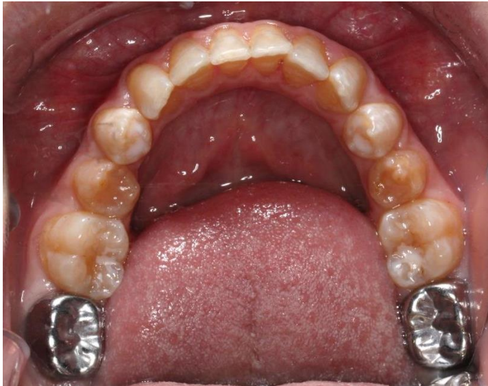
Fig. 7 Preformed metal crowns placed on the LL7, LR7 on a patient with chronological hypoplasia