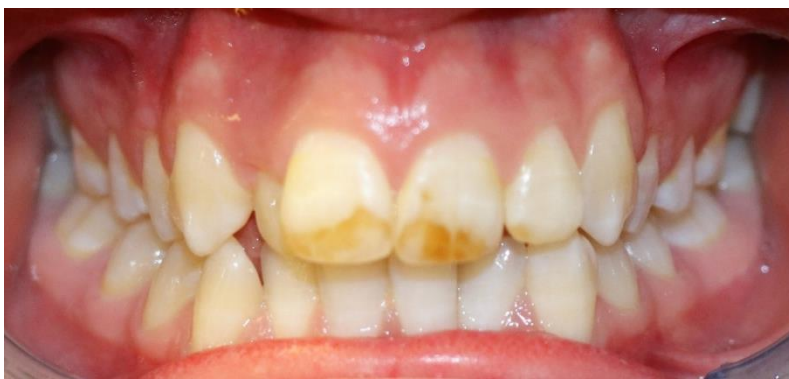
Fig. 6a Patient with molar incisor hypomineralisation prior to microabrasion and vital bleaching