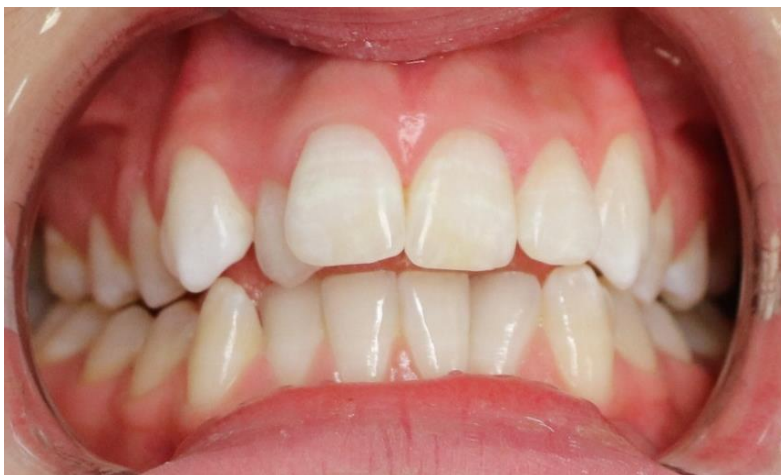
Fig. 6b Post micro abrasion and vital bleaching