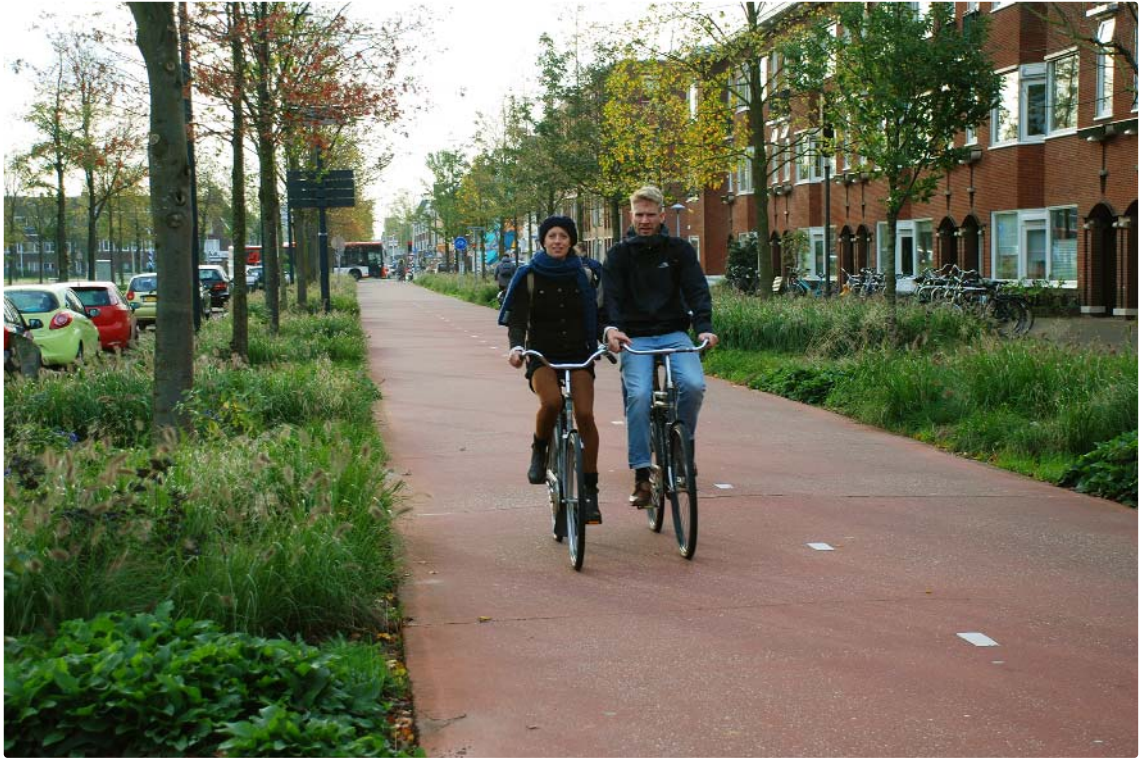
Cycle provision can be very generous when a traffic lane is removed – this type of provision allows side-by-side cycling and enables cyclists to chat while on their journey

those who drive to work. 5 This is a miracle cure – if we could put this in tablet form and charge for it, we would be making or paying billions for the medicine.