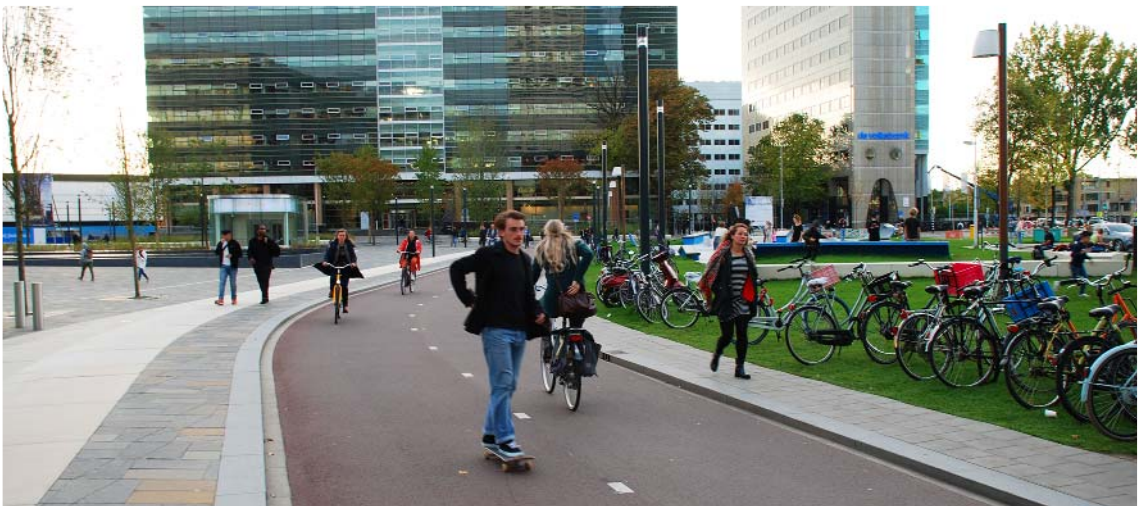
Cycling and other active modes of travel become the easiest and most fun ways of travelling around the city