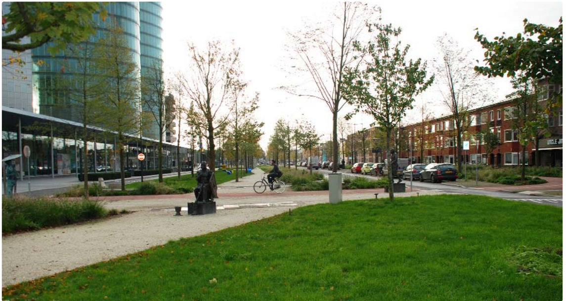
The inner ring road is given less space and a central park is provided

Stationsplein (station square) cycle parking facility was opened in 2019, designed by Ector Hoodstad Architects, and has space for 12,500 cycles and 1,000 OV-fiets (public transport hire bikes). This is a huge cycle parking space, built over three floors, under the station square linking Utrecht Centraal station to the neighbouring shopping centre and historic city centre.