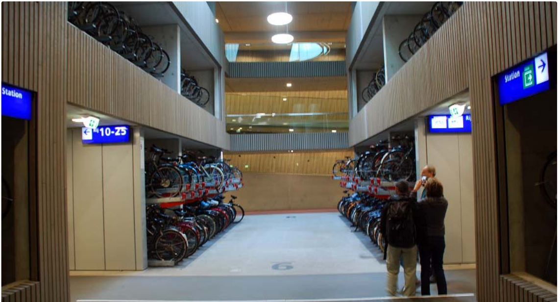
Cycle parking at the Stationsplein to the east of Utrecht Centraal station – 12,500 spaces over three floors

One of the major challenges in the Netherlands is providing space for cycle parking, and particularly in town centres and at central stations. Utrecht's