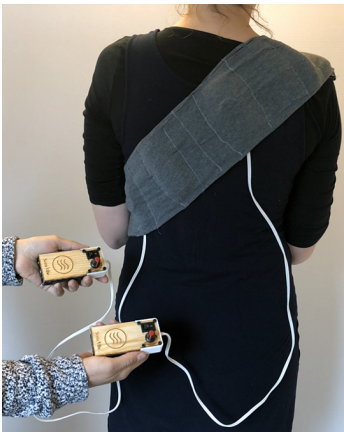
Figure 6. Soma Bits: designing bodily engagements with a first-person perspective using a toolkit of simple interactive devices.