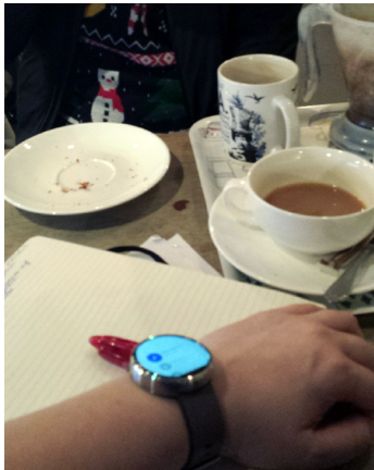
Figure 4. Cecchinato studied how smartwatch use and non-use affect social and personal interactions with respect to multi-device interactions and work-life balance.

systematic analysis to reduce complexity and to interpret these accounts in light of theoretical knowledge. Chien and Hassenzahl point out that without the latter dedicated interpretative step, detailed accounts of autoethnographical design risk remaining accounts of attempts to design and will hardly contribute to the body of knowledge in HCI and Interaction Design [3].