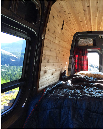
Figure 1. Living in a prototype: Desjardins investigated the ongoing and slow process of turning a van into a home.