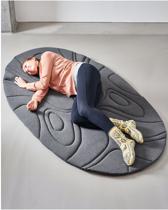
Figure 5. Soma Mat: an interactive experience leading to deepened body awareness.