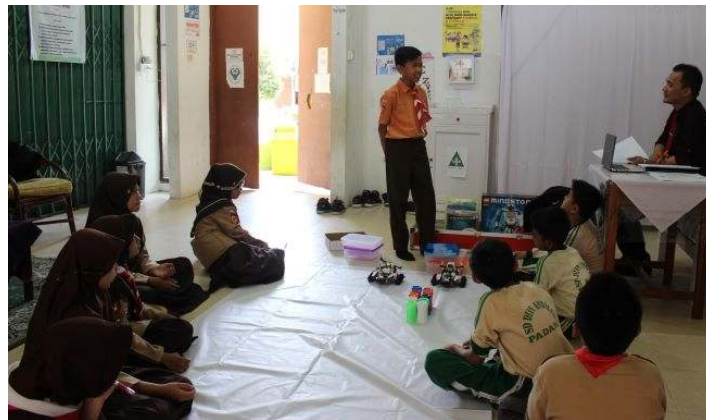
Figure 4. Students explain their robot

After that, the students were asked to give presentations on the explanation of the robot they had created, some of which included, the means by which such robots can interact with the environment, and the benefits of their robot. This activity was aimed at stimulating the students' skills to speak in public, convey ideas, learn how to deal with problems, as well as how to make up a story.