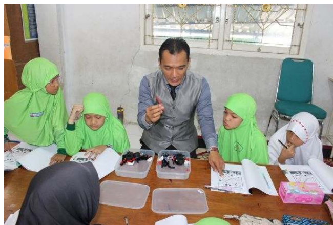
Figure 2. Teacher explanation about the components of Lego Mindstorms

Control center in Lego Mindstorms is the Brick. The Brick can send a programme to the motors, receive information from sensors, among other functions. Additionally, the Lego Mindstorms consist of a large motor and a medium one as an actuator. It also comprises of different sensors: the colour sensor, ultrasonic sensor, touch sensor, infrared sensor, gyro sensor, and the temperature sensor. This description was accompanied by displaying each of the components.