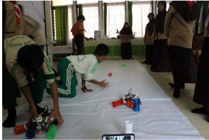
Figure 5. Robot competition