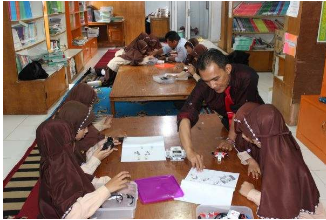
Figure 3. Students make tracker tank bot

In the third meeting, the students were asked to make robots based on their own creations in groups, which was aimed at hoping to improve their skills in creating a new way, creating a new thing, collaboration, teamwork, listening to the opinions of friends in one team, expanding, imagination, as well as modifying.