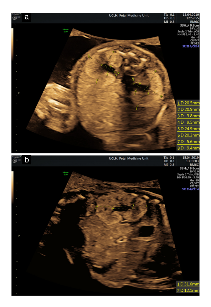
Figure 1 Axial plane (a) and sagittal plane (b) of hyperechogenic kidneys, showing measurement of their anteroposterior, transverse and longitudinal diameters, respectively.

Within the isolated-hyperechogenic-kidneys group, the AFI and the renal volume were compared between cases with normal and those with abnormal outcome. All data were tested initially for normality using the Kolmogorov–Smirnov test. Normally distributed data were analyzed using the parametric Student's t -test. Data that were not normally distributed were analyzed using the Mann–Whitney U -test for unpaired data. P < 0.05 was considered statistically significant. We also analyzed whether the presence or absence of risk factors for poor