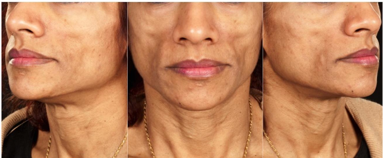
Figure 1. 48 year-old patient with clinical features of lipoatrophy involving the face