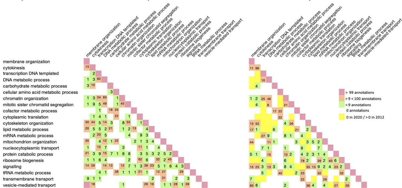
Figure 1. Annotation matrices showing fission yeast annotations for 21 selected GO term pairs in 2012 and 2020. Each row–column intersection off the diagonal shows the number of genes annotated to two different terms. Cells are colour-coded by number of co-annotated genes. Disputed phylogenetically-inferred annotations have been removed from the 2020 dataset.