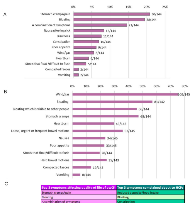
Figure 1 GI symptoms experienced by pwCF. (A) Symptoms which most affect quality of life for pwCF. (B) Symptoms which are experienced every day or most days. (C) Top three symptoms affecting quality of life for pwCF and the top three complained about to HCPs. HCPs, healthcare professionals; pwCF, people with cystic fibrosis.