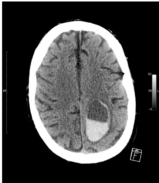
Figure 1. Typical blood-fluid level on an acute CT scan of a patient with an intracerebral hemorrhage in the left parietal lobe.

suggested as a marker for OAC-ICH 11,12 , but with the exception of one study (a sub-study of INTERACT-2) most published studies are case reports or were done on small samples 11–15 . In a study of 2065 patients from the INTERACT-2 study, blood-fluid levels on baseline CT (found in 19 patients in the sample) were associated with the use of warfarin as well as poor outcome 90 days after ICH 16 .