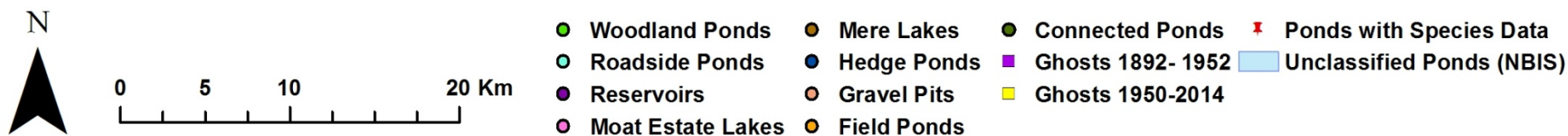
Figure 1: All ponds within the Norfolk Coast AONB - classified according to category