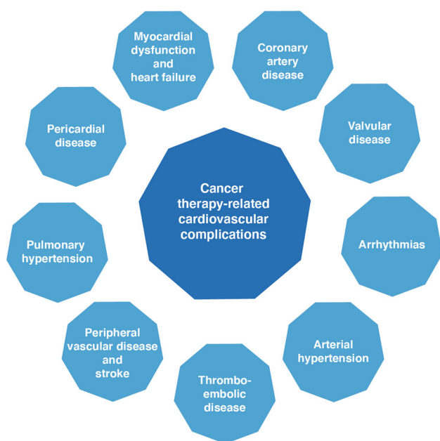
Fig. 2 Cancer therapy – related cardiovascular complications