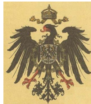
Above: Coat of arms of the Second German Empire

Likewise, the Imperial Crown as a popular symbol of Germany's glorious past now also came to stand for its equally glorious future which the Hohenzollern state would bring about. The crown had been given a new meaning according to the needs of contemporary politics. It now stood for a new interpretation of the term Reich , namely a politically (and militarily) strong German national