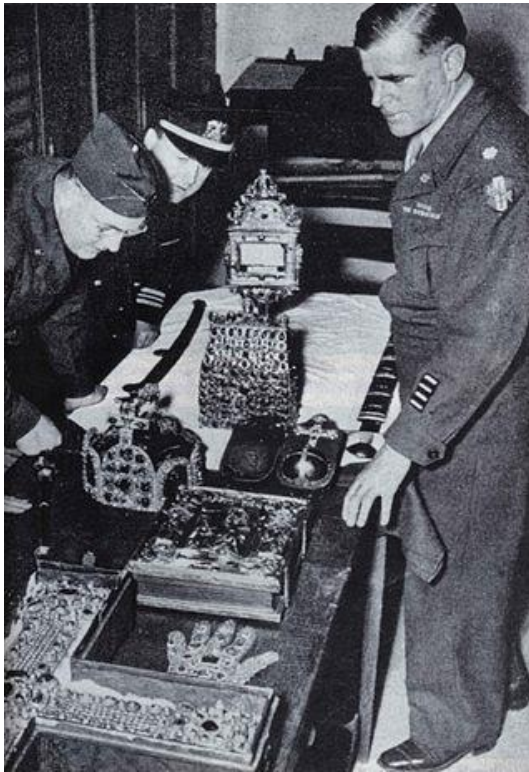
Left: The Regalia are returned to Vienna

kingdom; a term taken from the Bible signifying the kingdom of Christ (cf. Revelation 20). In its appropriation of the Imperial Crown, Nazi Germany used an obscure mixture of religious and historic symbols in order to consolidate its power. The Third Reich claimed to be the last and true successor of the former Holy Roman Empire.