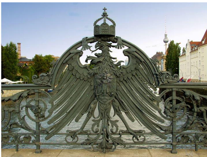
Left: Weidendammer Brücke, Berlin

As a last example, the Weidendammer Brücke , a bridge which is located close to the train station Friedrichstraße in the centre of Berlin and which has been newly constructed in 1896, boasts large imperial eagles on either side with the Imperial Crown on top.