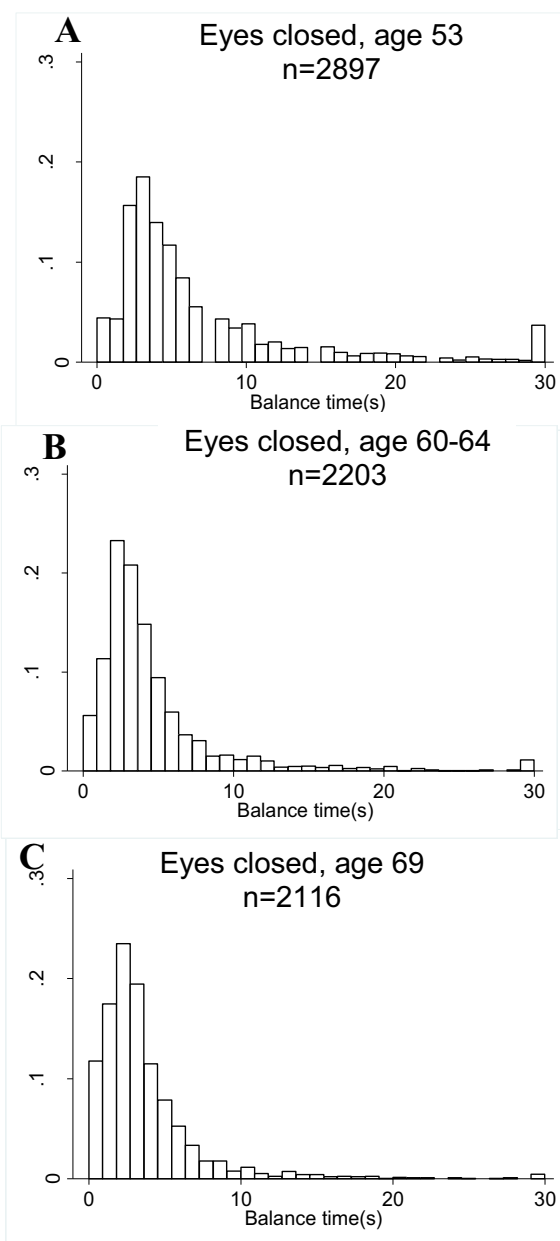
Fig. A.1. Distribution of balance times among maximal sample at ages 53, 60–64 and 69 years.