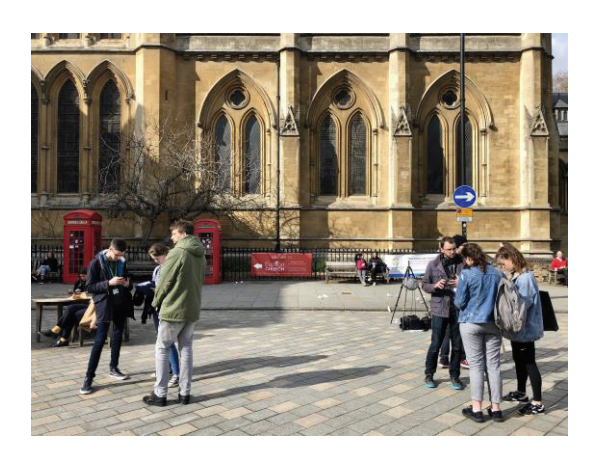
Figure 2 – The research team conducting a survey at Byng Place/Torrington Square in London in March 2019

The representative spatial recording will serve as the basis for the reproduction of a VR simulation in laboratory conditions and for testing physiological responses. It is performed to capture a consistent and representative five-minute period.