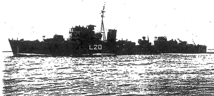
GARTH was a Batch I ship showing her as altered with only two 4 inch mounts, a cut down superstructure and bridge.