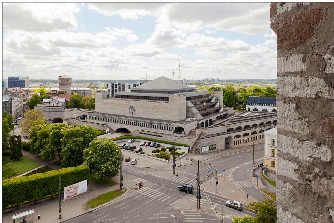
Figure 4: The National Library of Estonia in Tallinn, 1984–1993, architect Raine Karp.

conference to draw attention to the whole Nordic-Baltic region, rather than remain within the borders of the nation-state. As this was EAHN's first meeting in this area, we also saw the conference as an opportunity to expand the organisation's geographical reach and to critically address centre-periphery relations within Europe