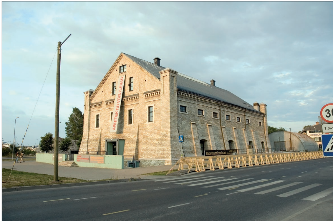
Figure 3: Museum of Estonian Architecture, Tallinn, 1908, architect Ernst Boustedt, reconstruction 1995–1996, architects Ülo Peil, Taso Mähar.