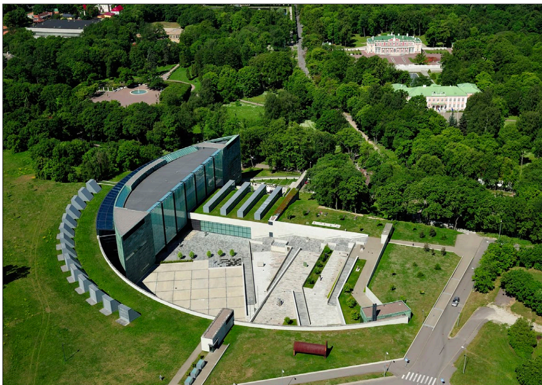
Figure 2: Kumu Art Museum, Tallinn, 1994–2006, architect Pekka Vapaavuori.

When we started preparing for the event more than two years ago (the proposal to host the conference was accepted at the EAHN business meeting in Pamplona in January 2016), one of the ambitions was to use the