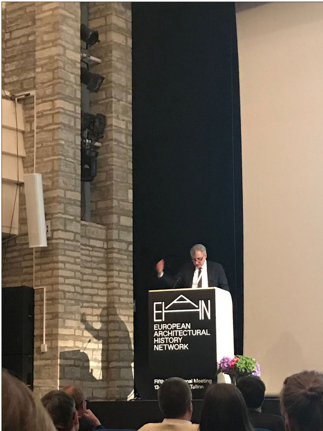
Figure 7: Reinhold Martin delivering the closing keynote at the 5th EAHN International Meeting in the National Library of Estonia, 16 June 2018.

whom, and in what manner. Indigenous voices, the voices of women, of the poor, of entire excluded and marginalised populations echo through the rooms and hallways of every single monument that we study, across the ages and around the world, their whispered truths exchanged among those who have been employed, if they are lucky, to clean the toilets.