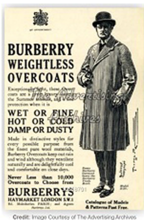
FIGURE 3 [Color figure can be viewed at wileyonlinelibrary.com ]

Beginning with the 1950s, several changes occurred in the way advertising practices are applied. Leiss, Kline and Jhally in their book on social communication in advertising (Leiss et al., 1997, p. 328) identified the "evolution of cultural frames for goods in relation to the development of media, marketing and advertising" (Leiss et al., 1997, p. 328) by analysing historical magazine advertising and advertising practices during 1890–1980. According to these authors, the 1950s were characterized by behaviourist marketing strategies and personalization in advertising strategies. Moreover, the topics covered in commercials during this decade include to "glamor, romance, sensuality, black magic, self-transformation" (Leiss et al., 1997, p. 329). Burberry's magazine ads during this period do not seem to reflect any of these themes that apparently were popular in the 1950. On the contrary, on most of its ads feature traditional couples and sometimes even the motto "A Family Tradition" as depicted in Figure 6.