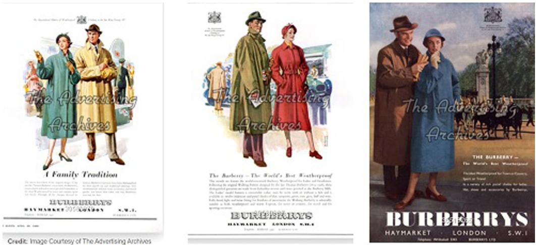
FIGURE 6 [Color figure can be viewed at wileyonlinelibrary.com ]

By the end of the 1990s, however, and during the 2000s, with Bravo's arrival as Burberry's CEO (Weston, 2016, p. 123), model Kate Moss started to dominate the company's ads campaigns, often photographed among groups of young and uninhibited people (Figure 9). In one ad, Kate Moss poses in a bathing suit made of the famous Burberry check, thus breaking the pattern of a conservative image. Bravo's marketing strategy considered, among other things, the combination of novelty elements with those aspects that made the Burberry brand a symbol of Britishness (i.e., "black taxi or red telephone box" (Pike, 2011, p. 123). The new image of the brand conveyed through the advertisements in fashion magazines, jointly with other measures of branding such as "brand association and placement among global celebrity" (Pike, 2011, p. 123) and marketing have been successful in creating a revitalized and aspirational image of the brand (Pike, 2011, p. 123).