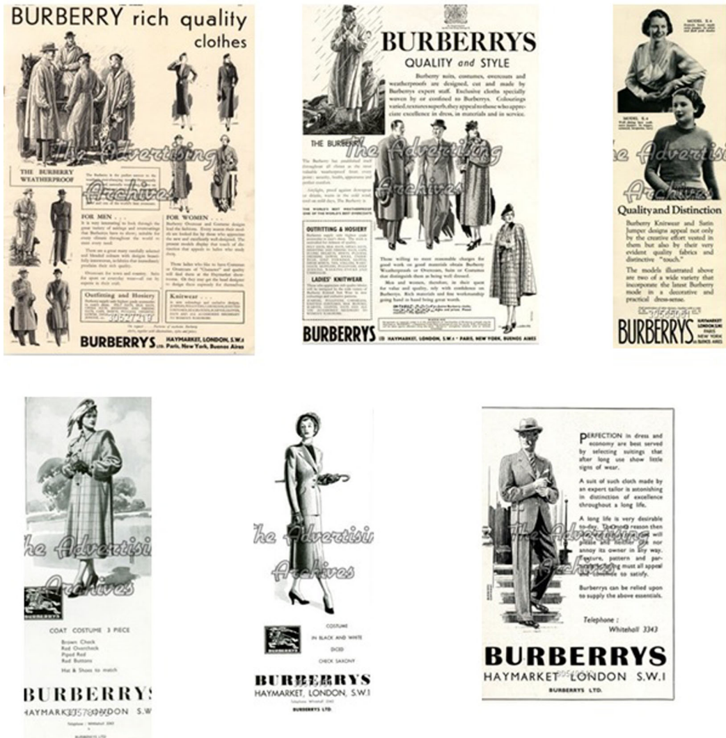
FIGURE 5 [Color figure can be viewed at wileyonlinelibrary.com ]

there: since the 1980s, excessive licensing of the brand in Asia and Europe (including for coasters, whiskey and umbrellas), although apparently bringing in sales, has diluted the “brand’s meaning and value” (Pike, 2011, p. 120). Thus, the end of the product distribution era caught the Burberry brand in a “relative decline” (Pike, 2011, p. 130), one in which it had lost its component of “luxury exclusivity and premium pricing” (Pike, 2011, p. 123).