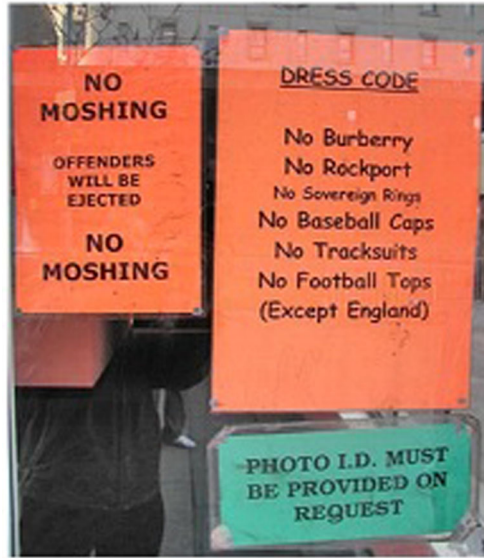
Snobs' club, Birmingham, 2004.

faced with the question of determining the image of a brand that is tarnished or unfairly taken advantage of. Indeed, it is hard to believe that in a context similar to the one presented above a new market entrant would like to be associated with a brand tarnished by a category of consumers with a bad reputation. What is however interesting is that this conflict between what Burberry wanted to communicate through its brand and what Burberry actually meant for UK consumers has led to a drop in demand for Burberry products, particularly in central London (Weston, 2016, p. 191). Thus, consumers' perception of the brand had a direct effect on the “economic behaviour of other consumers”. This example should therefore be a convincing argument in support of the idea that when a brand's reputation needs to be proven, it is not enough for the person claiming tarnishment or free-riding to prove only how it has positioned her brand. It is even more relevant to see how the brand was received and perceived by the public. On the other hand, this example seems to confirm the assertion that, mainly at that time, those who lost controlled over the communication channels suffered negative consequences.