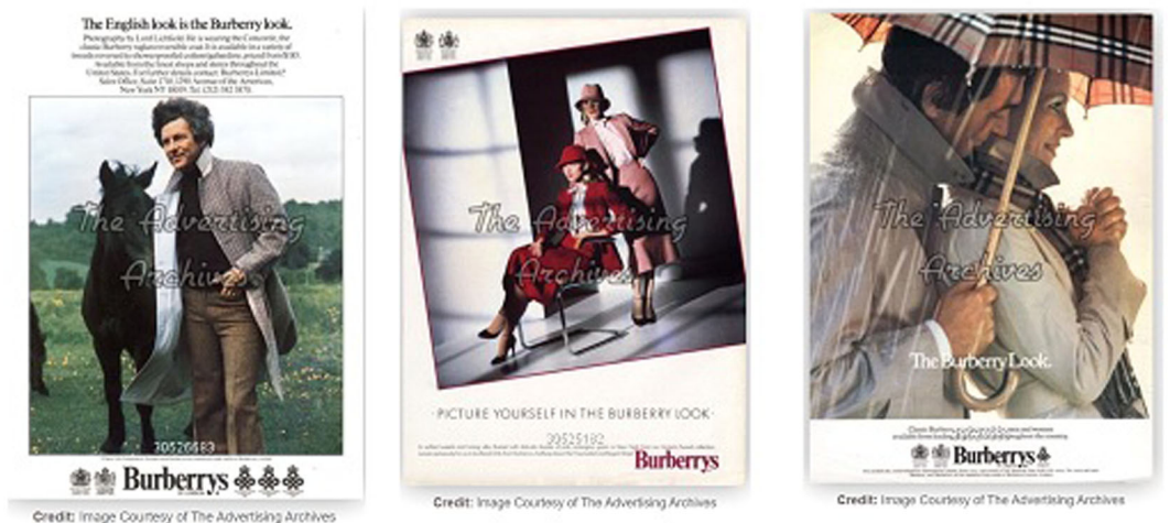
FIGURE 7 [Color figure can be viewed at wileyonlinelibrary.com ]

By the end of the 1990s, however, and during the 2000s, with Bravo's arrival as Burberry's CEO (Weston, 2016, p. 123), model Kate Moss started to dominate the company's ads campaigns, often photographed among groups of young and uninhibited people (Figure 9). In one ad, Kate Moss poses in a bathing suit made of the famous Burberry check, thus breaking the pattern of a conservative image. Bravo's marketing strategy considered, among other things, the combination of novelty elements with those aspects that made the Burberry brand a symbol of Britishness (i.e., "black taxi or red telephone box" (Pike, 2011, p. 123). The new image of the brand conveyed through the advertisements in fashion magazines, jointly with other measures of branding such as "brand association and placement among global celebrity" (Pike, 2011, p. 123) and marketing have been successful in creating a revitalized and aspirational image of the brand (Pike, 2011, p. 123).