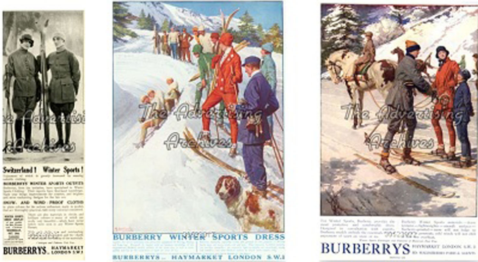
FIGURE 4 [Color figure can be viewed at wileyonlinelibrary.com ]