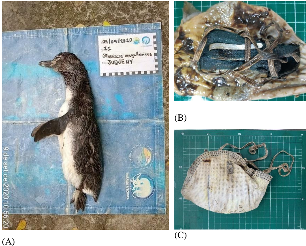
Figure 3. Penguin found dead in São Sebastião (A). Mask inside the open stomach during the necropsy (B). Detailed face protective mask (C).

atrophy in the muscles of the pectoral region. Upon accessing the celomatic cavity we observed caseous plaques in the interclavicular and cranial thoracic air sacs, suggestive of infectious aerosacculitis. In the analysis of the digestive system, we noticed that the syntopy and the silhouette of the stomach showed changes and, after exploring the organ, we found traces of food content associated with a solid residue of intensely firm consistency, which we confirmed to be a full PFF-2 protective mask (3M brand) (Figure 3), with sufficient size and structure that made it impossible to pass through the transition lumen from the stomach to the small intestine. For this reason, we attribute the ingestion of the mask as the main cause of death.