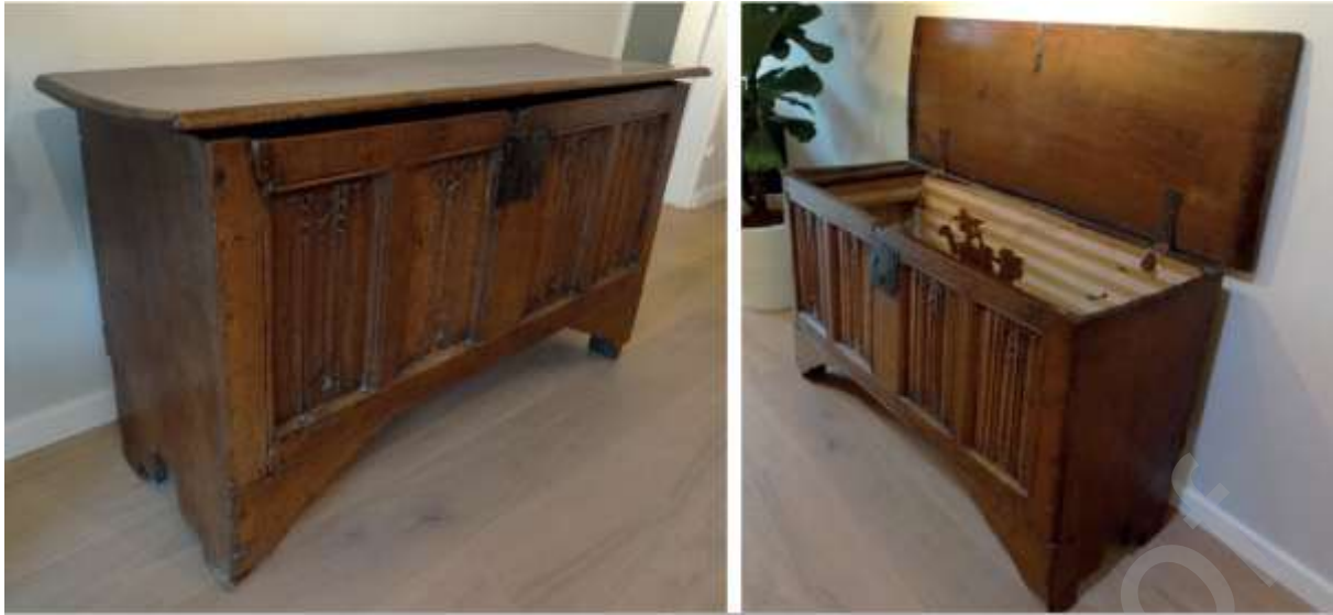
Figure 1. Chest with linenfold panels. [2-column figure; colour]