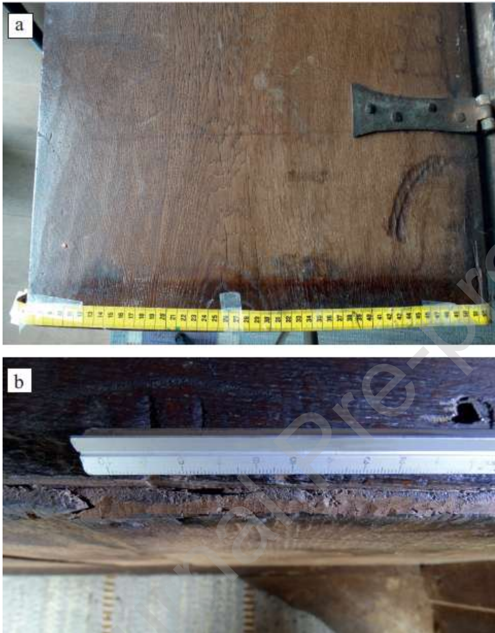
Figure 3. Tree-ring acquisition. a) One of the parts of the chest (inner side of the lid) where tree rings were photographed in the transverse/radial section dendrochronological research; these measurements produced relative values; c) detail of the preparation with scalpel knives in the transverse end of the bottom middle board, where the V groove joint can be observed. These measurements represent absolute values. [single-column figure; colour]

scraping the surface with a plain; j) partial mark on the underside of the left bottom board; k) right spandrel, which is fixed to the right side board with metal nails. [2-column figure; colour]