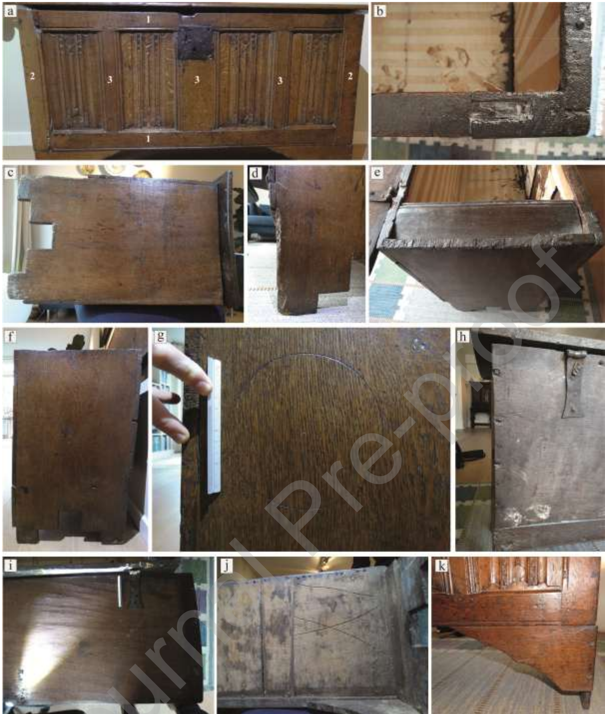
Figure 2. Construction features. a) front of the chest with the linenfold panels (numbers indicate: 1, rails; 2, stiles; and 3, muntins); b) tongue-and-groove join of the horizontal top rail to the right vertical stile; c) left side board, tangentially processed; d) heartwood/sapwood boundary is present on the lower back of the board; e) the transverse end at the top of the board is rough and unpolished, no nails are present; f) right side board, with a rough unpolished transverse end at the top (two nails are present but not in view here); g) circle of 14 cm diameter carved with compass; h) the back is made out of a wide tangential board and a narrow rail closing up the lower part; they are attached to the side boards with metal nails; i) tool marks on the inner side of the lid resulting from