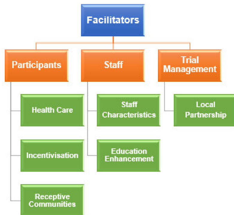
Figure 4. Graphical illustration of themes and sub-themes of the facilitators.