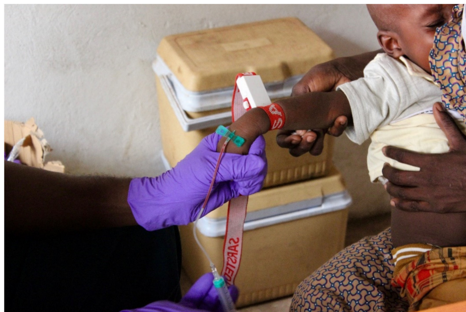
Figure 3. Photograph of blood drawing during a visit to the study clinic.

Community education levels were believed to impact the communication of trial information. While many men attend secondary school, women often leave school during puberty to start a family. The low level of education was viewed as a barrier to informing communities about the trial: “The level of awareness, literacy and education here is a challenge because you want to be sure that the people you are conducting research on are aware of what your study is about and what the implications are” (Research Clinician). Another barrier was the misunderstanding about blood sampling. State Enrolled Nurse 1 pointed out that some parents were reluctant for their child to join the trial (and others withdrew) when they learnt blood drawing was involved (Figure 3). This was linked to lack of education and local attitudes towards confusion around clinical research: “Sometimes the awareness is an issue, some people have the wrong sentiment with the local mindset” (Data Manager). To overcome this barrier, IHAT-GUT used village sensitisation to inform all villagers about the trial and of what it consisted.