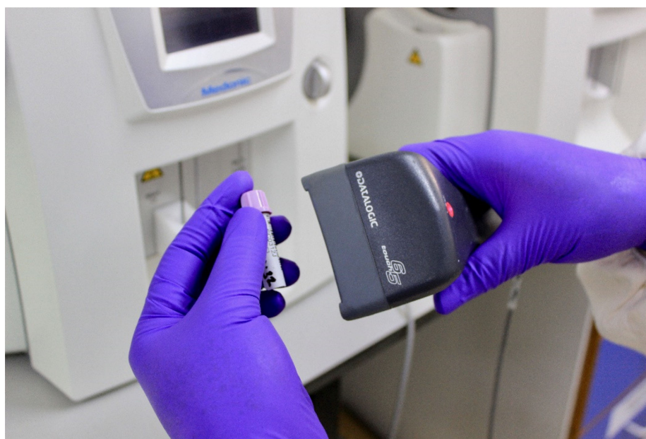
Figure 5. Photograph of sample processing done to Good Clinical Lab Practice standards.

MRCG’s research unit has been in the Gambia for 70 years, giving them respect in the country for their long-standing establishment, advances in healthcare, and facilities for epidemiological studies and clinical trials. MRCG’s upstanding reputation with The Gambian Government and communities allowed easier collaboration and authorisation from the government: “MRC has a great track record here in the Gambia, they have cordial relationships with the communities and with The Gambian government and its ministries” (Nutrition Theme Administrator). The Field Coordinator noted that MRCG has an international research reputation: “They have a high regard in terms of quality research, and they have been in existence for almost 70 years” (See Supplementary Figure S3). The Analytical Project Manager was grateful for the high-quality facilities, which allowed the project to run smoothly (Figure 5).