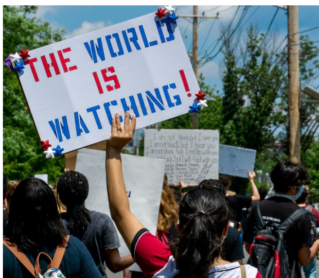
Figure 3. Juneteenth Black Lives Matter George Floyd Protest, Teaneck, New Jersey. 19 June 2020.