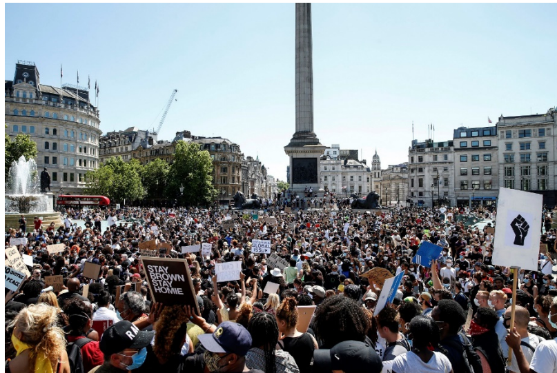
Figure 2. People gather during an anti-racism protest in Trafalgar Square on 20 June 2020.

I scrapped this beginning many times. Before I could finish my thought—attend to what I thought I was supposed to be seeing when I looked at countless photographs of empty streets and public squares—the streets (or at least the records of them) were full again. 3 As of May 2020, my daily news feed was made up of photographs of people, millions of them, moving through streets all over the world (Figure 2). They were marching and chanting—protesting—against the murder of George Floyd and systemic anti-Black violence. 4 The opposition between the records of street life in the spring of 2020 is striking, and not simply because it neatly or purposely exacerbates the violence of civil unrest—because it makes a raised hand or a clenched fist appear that much more palpable, that much more strident. The opposition is striking because it exacerbates the violence of civic life. Records of protesters filling the streets of numerous cities, large and small, suggest that for much of the world’s population, there is no future to be haunted by. For many marching and chanting—protesting—the streets are not public. They are carceral and alienating. 5 The streets, as urban theorist and historian Mike Davis notes in his response to the failure of the Trump administration to prepare for the future—for what they knew was coming —need to be reclaimed. 6 They need to be made public.