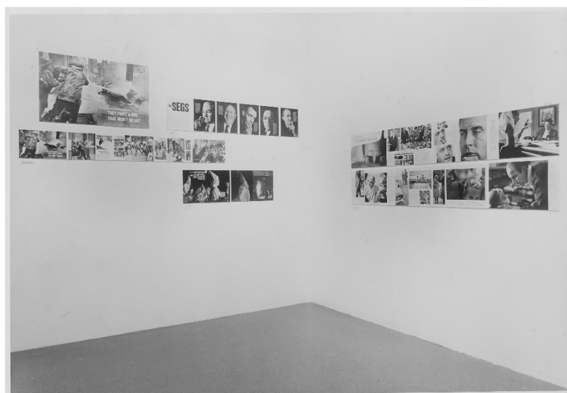
Figure 5. Installation view of The Photo Essay . 16 March–16 May 1965. Gelatin silver print, 16.5 × 24.1 cm. Object Number: IN760.11.

In the 1960s, on the walls of the Museum of Modern Art, photography was powerfully impoverished. It entered into what Allan Sekula once referred to as the “late modernist cul-de-sac” (Sekula [1978] 1984, p. xii). This is the perfect metaphor for the “dead end” of Szarkowski’s modernism, for a reconceptualization of the plasticity of art that ensures the rule of the single anecdote. 20 History, to be sure, is not dispensed with in Szarkowski’s account of photography’s development; it is rendered fixed and finite. Photography, Sekula explains, “was a visual art for which, unlike cinema, discontinuity and incompleteness seemed fundamental, despite attempts to construct reassuring notions of organic unity and coherence at the level of the single image” (Sekula [1978] 1984, p. xii). Sekula’s critique of modernism and Szarkowski exceeds the call for more than one image, for series and sequences and pages, as is often argued. 21 Multiplicity is not enough. Narrativity—futurity—is what matters. Photographs are never finite, done. There is always the gap, where another story could or should be told, made. There is not authorship so much as agency.