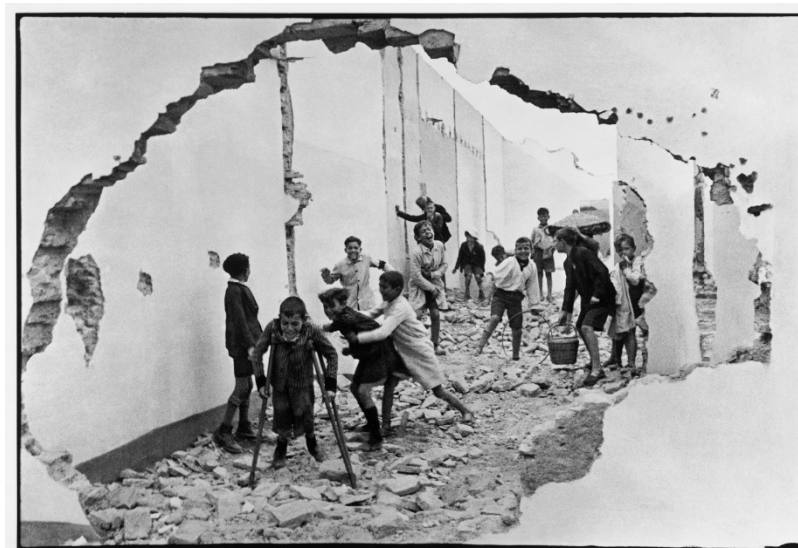
Figure 4. Henri Cartier-Bresson, Spain, Andalusia, Seville , 1933.

Written from Cartier-Bresson to Hugo or Manet and back again, the history of the genre becomes a story about the invention of the decisive moment. It is written in order to welcome Cartier-Bresson as much as make inevitable his arrival.