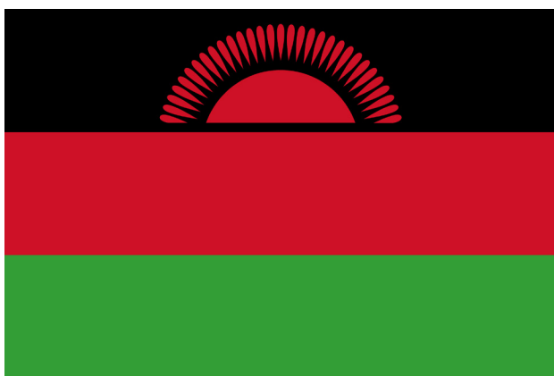
Figure 2 Flag of Malawi ( http://flagpedia.net/malawi ; accessed on 20 February 2018).

for poststroke follow-up. 8 79 Epilepsy also presents a high burden; it is stigmatised and managed by psychiatric nurses. The supply chain of government-commissioned antiepileptic drugs is rarely sustained. These scenarios are far from desirable but highlight the daily barriers faced in managing neurological conditions in this setting.