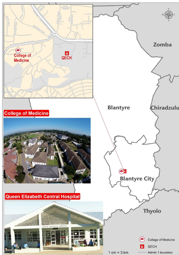
Figure 4 Aerial photograph of the College of Medicine main campus (top) and entrance to the accident and emergency department of the Queen Elizabeth Central Hospital (QECH) (bottom).

neurologists has hugely benefited patient care. 10 The continued need for this collaboration in Malawi has inspired the Blantyre Institute of Neurological Sciences (led by the fourth author) and the Malawi Stroke Unit (led by the third author). The long-term ambition of these initiatives in Malawi, as well as improving health outcomes, is to promote integrated neuroscience training in the country. There are ongoing plans to undertake epilepsy surgery, and the success of this will require neurologists and neurosurgeons to collaborate. A long-term goal is to construct a dedicated building to accommodate the Neurosurgery Unit, the Centre for Mental Health and Neurology Services. In the meantime, Malawi's first stroke unit should open in 2019, and will start to consolidate this important interdisciplinary partnership.