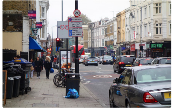
Pairwise comparisons – for example Clapham versus Camberwell

associated health benefits, or the knock-on impacts on private investment in an area.