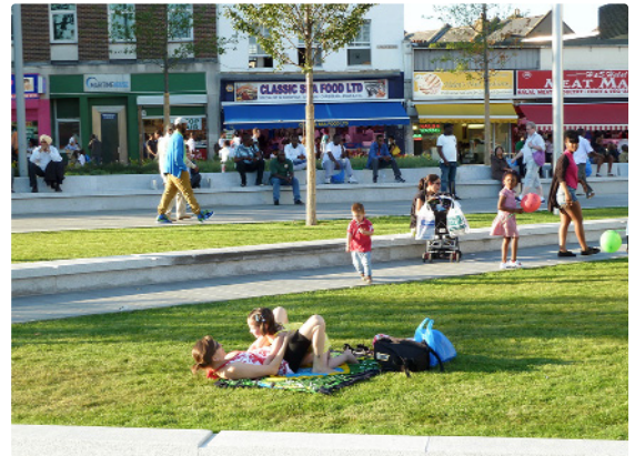
There is a window of opportunity for high-quality streets