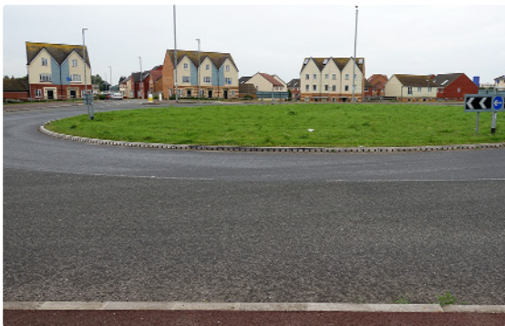
Crude and generic highways design standards are local codes – of sorts

By themselves, local codes and pattern books are no guarantee of quality or a fast-track to beauty. Achieving that requires a move away from the standardised approaches of the past, towards one in which schemes are genuinely designed for sites in a manner that seeks to optimise place value through design outcomes that are sustainable, healthy, attractive, and socially equitable. That may or may not use ready-made typologies of homes, but necessitates a careful site-specific and up-front design process of the sort that all the examples used to illustrate the White Paper will have benefited from. Research has consistently shown that this up-front investment in design quality takes time – there is no way around that if we want high-quality outcomes – although this is paid back in a more streamlined regulatory processes further down the line.