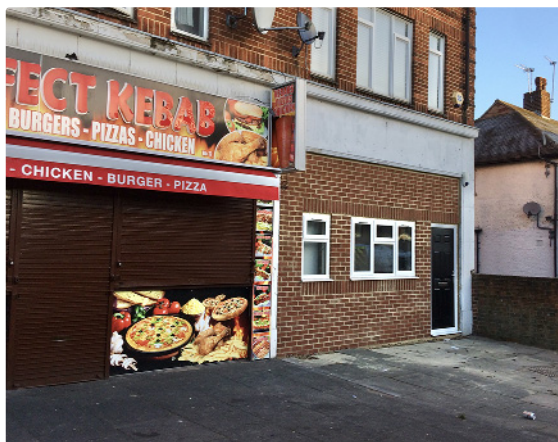
Retail-to-residential conversion without control delivers poor-quality accommodation and an uglier environment

some welcome proposals to make, to which I will return later. First, however, it is necessary to deal with the major structural changes proposed by the White Paper and in other recent announcements from government.