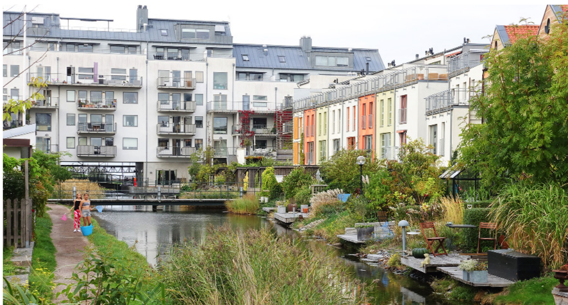
High-quality housing is a feature of many of many continental European planning systems based on careful site-specific design coding

clear and concise set of site-based design parameters early in the development process as a means to guide more detailed design work later on. It also commits to legislate to require site-specific codes as a condition of permission in principle in growth areas. This should be extended to all significant development sites with, at the very least, a co-ordinating code produced for all sites over, say, 30 units. Their status also needs to be clarified in the proposed revisions to the NPPF – once prepared they should be fully enforceable by local planning authorities and not just guidance that can be ignored by less scrupulous developers once they have their ‘automatic’ permission.