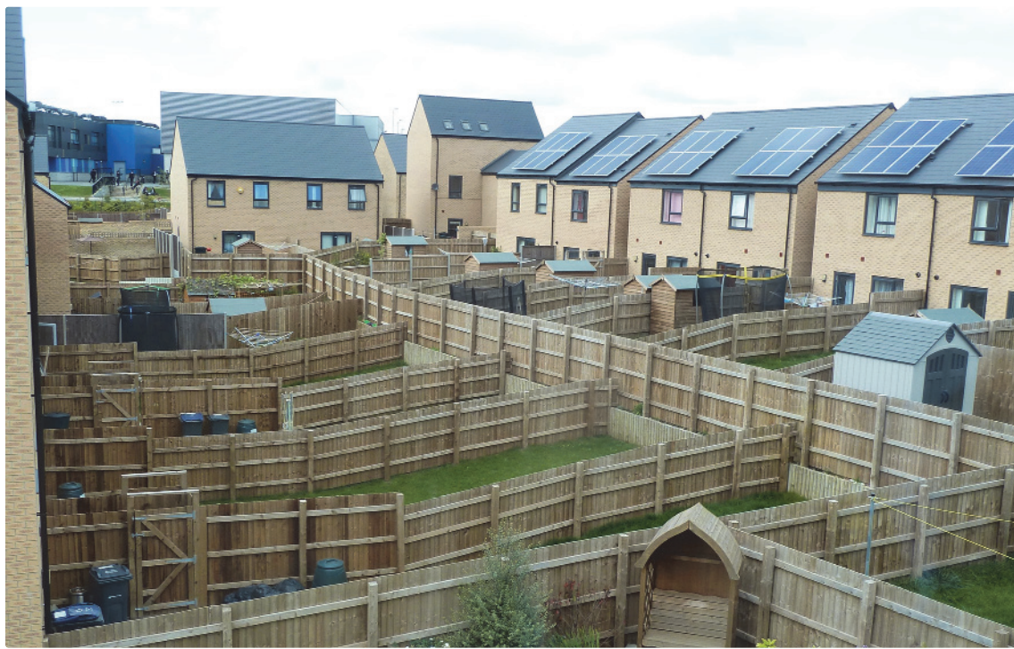
Access to private open space is critical, even if only to a balcony

dropped away markedly over ten minutes. There has been much talk during the crisis about the benefits of 15- or 20-minute cities. This research suggested that a ten-minute city should be the aspiration.