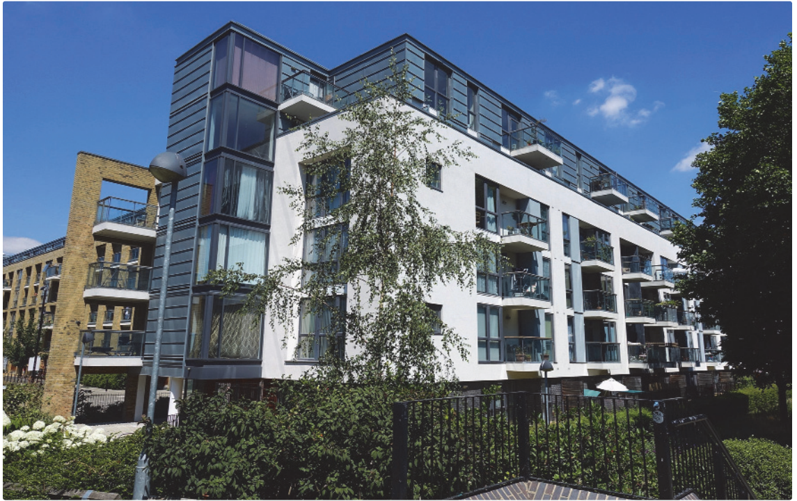
Extra care is required to meet everyday comfort needs when building dense and high

were the most comfortable, followed by those with a private balcony or shared garden. Households with no access to any sort of private open space were considerably less comfortable. Space standards were also critical, and dwellings were noticeably more comfortable the more rooms there were per occupant. Dwellings with five or more occupants were noticeably less comfortable during lockdown.