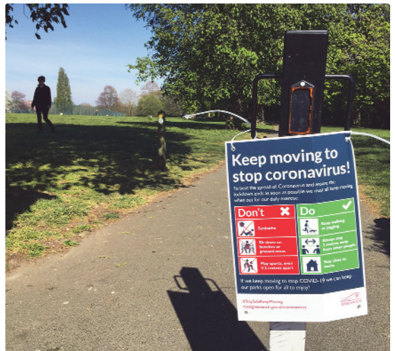
Key amenities, including green space, should be within a ten-minute walk

Proximity to a park or significant green space (within a five-minute walk) was the strongest predictor of satisfaction with neighbourhoods during lockdown, with satisfaction dropping off markedly the further away open space was, and significantly