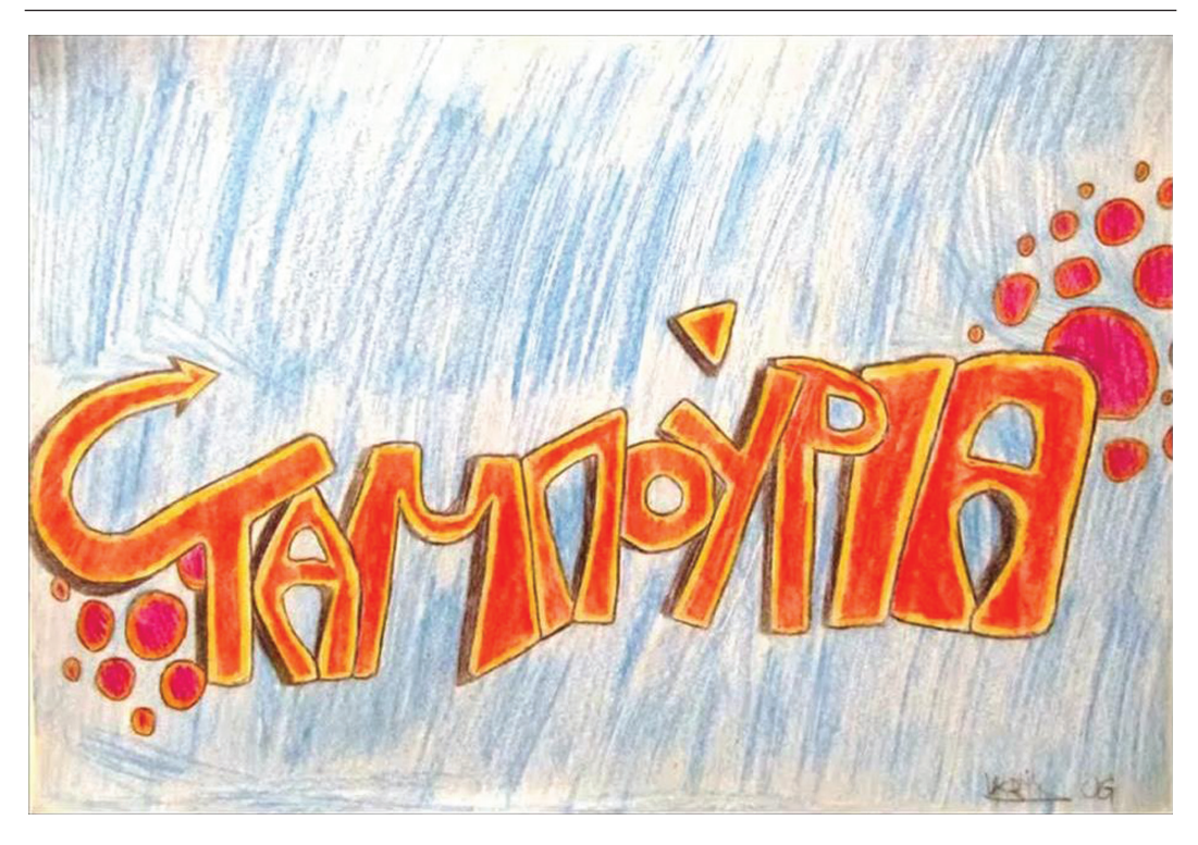
Figure 2: Screengrab from the documentary showing the last graffiti shot

a series of images in their minds formed by the reading of history books, exposure to archive material in school settings, documentaries, family narrations (with and without the use of visual material such as photographs) and a broader cultural memory of past experiences inherited from the communities of which the students were a part.