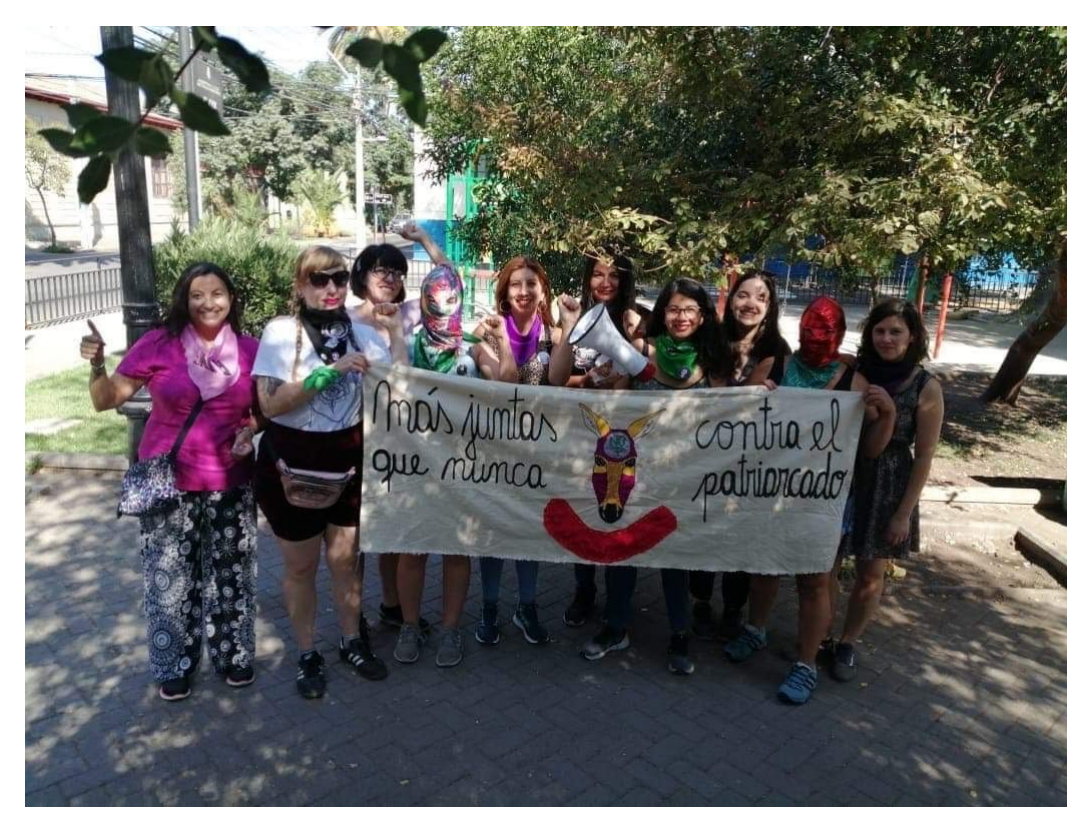
Figure 6 8 March 2020 – Plaza Huemul – feminist members of the Huemul Assembly before their participation in the 8 March General Feminist Strike. The banner reads: 'More together than ever against patriarchy'.