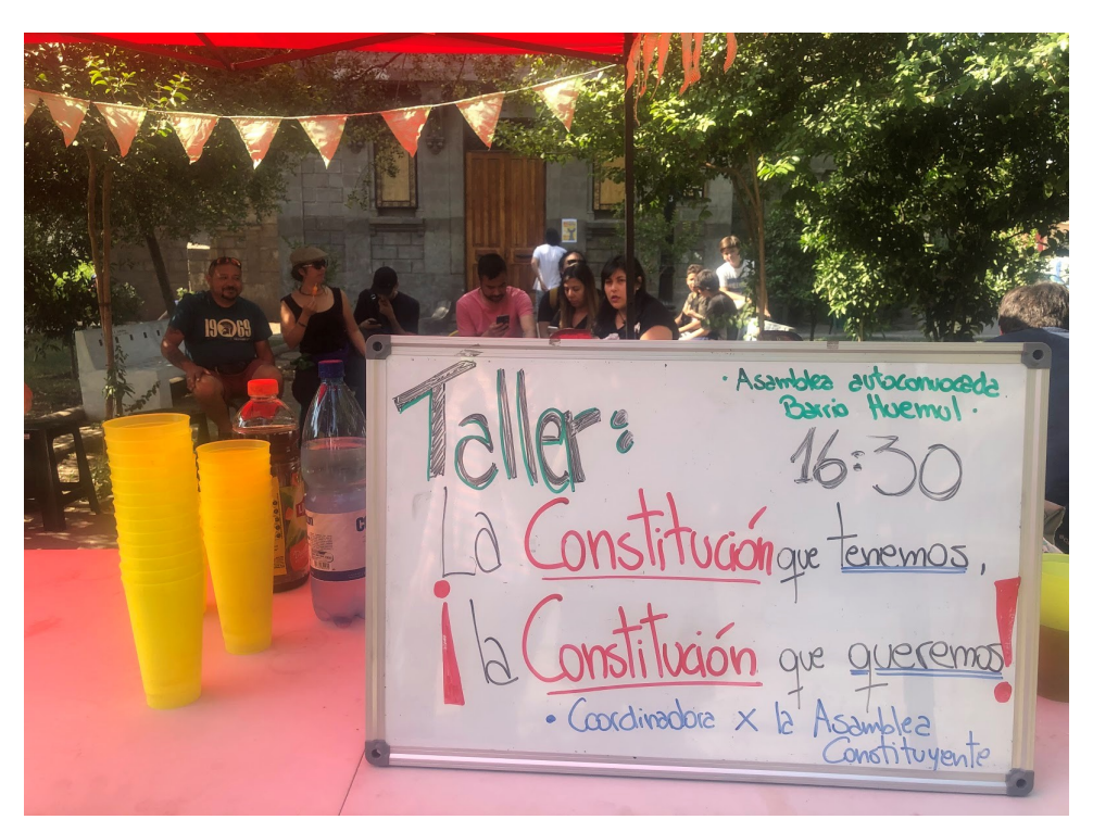
Figure 5 23 November 2019 – Plaza Huemul – workshop organised by the Huemul Assembly on 'The Constitution We Have, The Constitution We Want' (Source: Author, 2021).

Leading up to Huemul's anniversary event, assembly members discussed their concern that the movement was losing steam as fewer protesters gathered at Dignity Plaza and more people returned to work. Furthermore, the signing of the 15 November Accord for Social Peace and a New Constitution by a group of politicians, including members of the Broad Front leftist coalition, fomented anger due to the lack of transparency and sparked funas against leftist politicians who signed the accord, fracturing