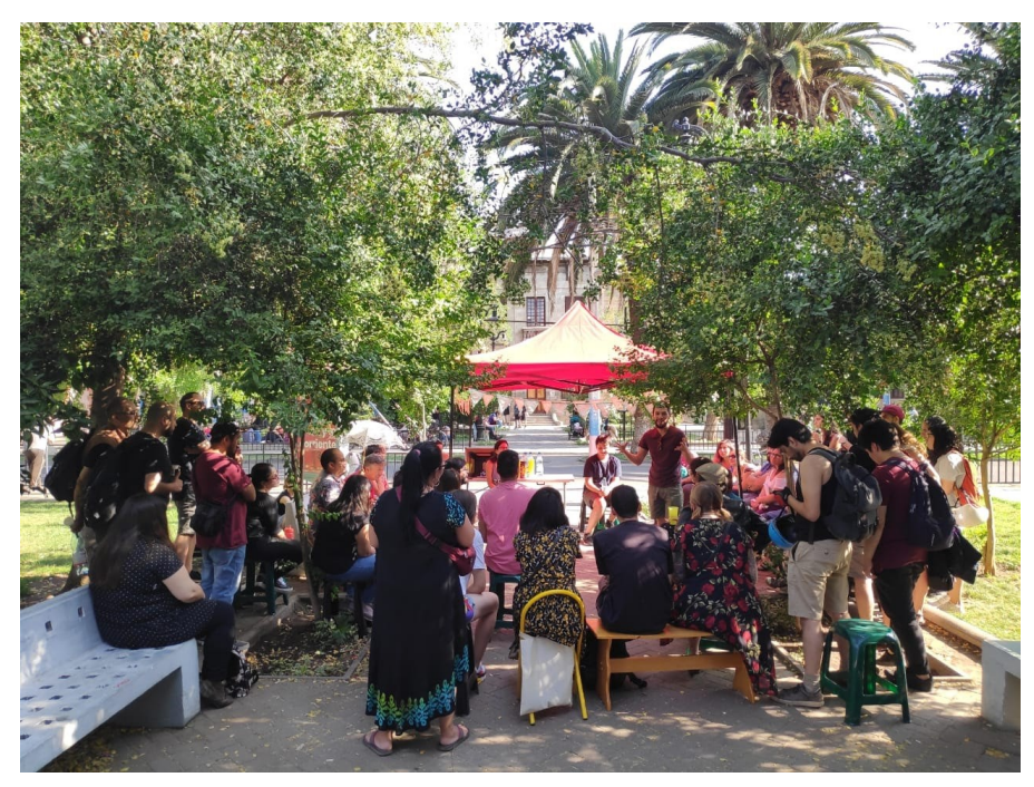
Figure 4 23 November 2019 – Plaza Huemul – Workshop organised by the Huemul Assembly on 'The Constitution We Have, The Constitution We Want'.