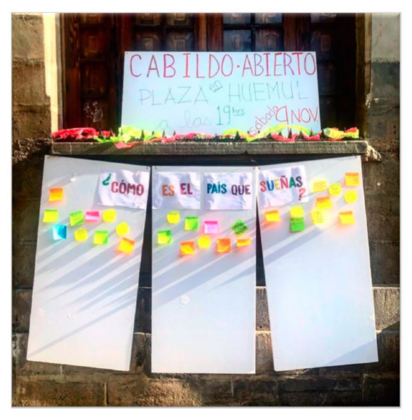
Figure 1 3 November 2019 – Plaza Huemul – The Huemul Neighbourhood Assembly promoting the planned community cabildo at an outdoors community musical event. The community question board asks: What type of country do you dream of? (Source: Author, 2021).

The fifth section compares the politics of popular power, or poder popular , to use the language of the early 1970s, a concept that links the awakening that followed the UP's 1970 victory with the October 2019 moment when Chile despertó . It discusses the politics and cultural representation of popular power as a lasting legacy of the Chilean left that lives on in the current moment. The final section shows how collective trauma, popular power and feminism coalesce in the neighbourhood assemblies. By focusing on the Huemul Neighbourhood Assembly (see Figure 1) from its formation to its participation in the 8 March 2020 Feminist General Strike, I offer a localised example of the challenges facing those who seek to transform the 2019 revolt into lasting change.