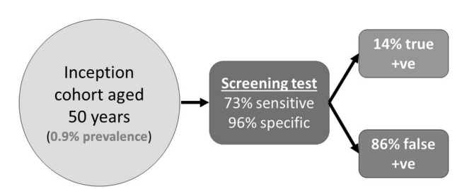
Fig. 1 Predictive performance of a screening test (73% sensitivity and 96% specificity) when applied to an inception cohort of 50 years of age with a glaucoma prevalence of 0.9%.

One strategy could be targeting screening to families of people with POAG. First-degree relatives of glaucoma patients have been shown to have a ninefold increased risk of developing glaucoma in their lifetime compared to relatives of controls in the population-based Rotterdam Study [22]. The higher prevalence of glaucoma in first-degree relatives will improve the positive predictive value of any test, thereby reducing false-positive referrals. While a formal screening programme targeting firstdegree relatives of glaucoma sufferers makes theoretical sense, the practical application may not be straightforward. For example, there would need to be a clear definition of which glaucoma patients should have their relatives screened (e.g., POAG only or other types of glaucoma as well) and these individuals would need to be accurately identified at scale nationally. Self-report of disease status is unreliable for glaucoma overall, and would likely be worse for specific sub-types of glaucoma. In the future, increasing uptake of electronic medical records may enable a digital national glaucoma registry which could inform targeted screening of first-degree relatives. However, many challenges would persist including the practicality and ethical and information governance implications of sharing health information or linkage of health records with relatives.