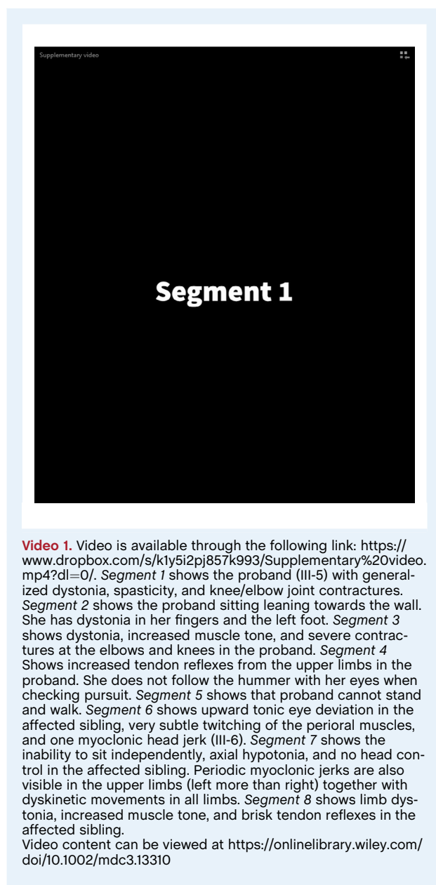
Video 1. Video is available through the following link: https://www.dropbox.com/s/k1y5i2pj857k993/Supplementary%20video.mp4?dl=0/ . Segment 1 shows the proband (III-5) with generalized dystonia, spasticity, and knee/elbow joint contractures. Segment 2 shows the proband sitting leaning towards the wall. She has dystonia in her fingers and the left foot. Segment 3 shows dystonia, increased muscle tone, and severe contractures at the elbows and knees in the proband. Segment 4 Shows increased tendon reflexes from the upper limbs in the proband. She does not follow the hummer with her eyes when checking pursuit. Segment 5 shows that proband cannot stand and walk. Segment 6 shows upward tonic eye deviation in the affected sibling, very subtle twitching of the perioral muscles, and one myoclonic head jerk (III-6). Segment 7 shows the inability to sit independently, axial hypotonia, and no head control in the affected sibling. Periodic myoclonic jerks are also visible in the upper limbs (left more than right) together with dyskinetic movements in all limbs. Segment 8 shows limb dystonia, increased muscle tone, and brisk tendon reflexes in the affected sibling. Video content can be viewed at https://onlinelibrary.wiley.com/doi/10.1002/mdc3.13310

and dystonia with hyperreflexia seen in the present cases have also been reported in ADCY5 -related disease with AD inheritance. 1,6,7 The typical choreiform movements often characterized as piano playing movements were absent in the present cases. This could be explained by the phenotypic variability of ADCY5 -related disease. Of note, ADCY5 -related dyskinesia appears to result from either a gain or loss-of-function mechanism, although the underlying mechanisms accounting for these differences are not yet fully understood. 7 The homozygous LOF variant could potentially account for the phenotype severity in the present family. This LOF variant does not seem to express itself into a disease phenotype in the heterozygous state, as both parents and one heterozygous carrier sibling remain disease-free. This could be explained by the residual enzyme activity conferred by the wild-type allele.