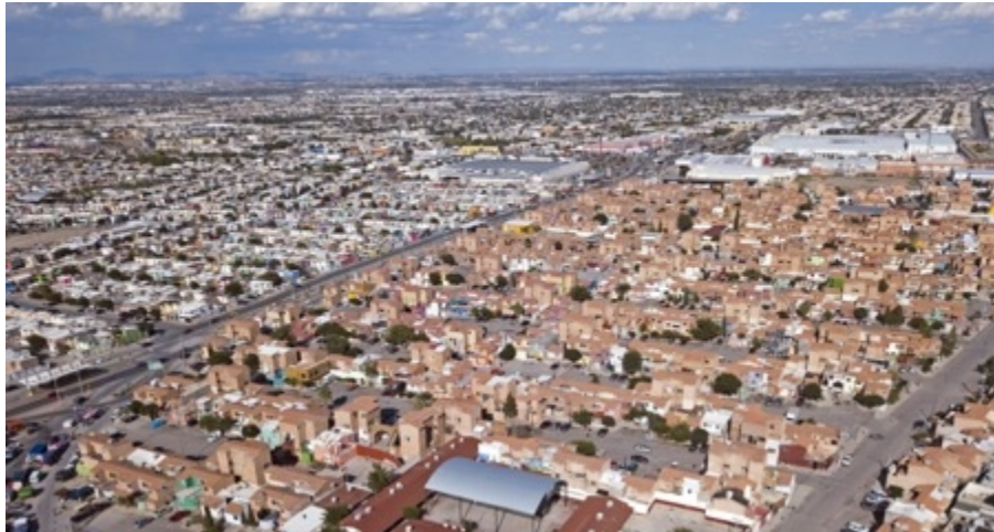
Figure 2. Public housing scheme in Ciudad Juarez