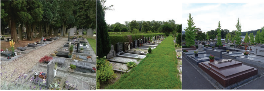
Figures 6–8. Examples of cemeteries in The Netherlands and Luxembourg. From left to right: photos from Tongerseweg municipal cemetery in Maastricht; municipal cemetery Noorderbegraafplaats in Leeuwarden; Notre Dame in Luxembourg-City.