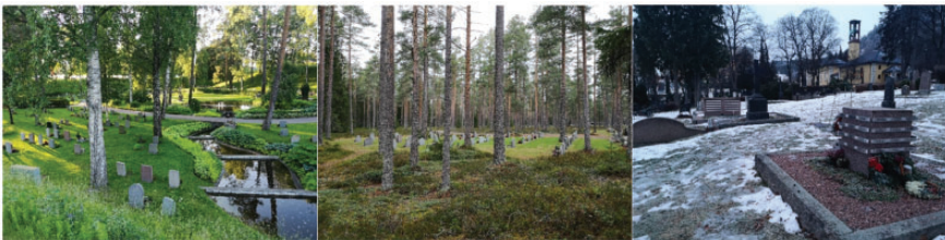
Figures 1–3. Examples of cemeteries in Scandinavia. From the left to right: photos from the main cemetery St Eskil in Eskilstuna; woodland cemetery Röbbäck in Umeå; collective memorial at the central cemetery Bragenes in Drammen, the yellow building in the back is the crematorium.