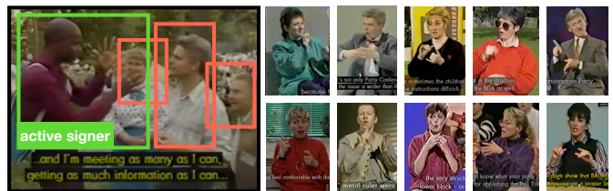
Fig. 1. The SEEHEAR dataset. In this work, we propose a signer tracking and diarisation framework and automatically annotate 90 hours of in-the-wild sign language content.

In this work, our goal is to address this issue by collecting and automatically annotating a large-scale, diverse dataset of